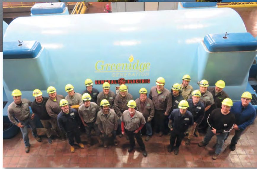
Workers at Greenidge Generation on Seneca Lake — standing next to the nearly 80-year-old original turbine — are the first at a joint powerhouse and bitcoin mine to join the IBEW.