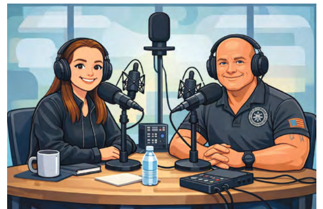
Local 1347 launches a new podcast, "Wired for Work."