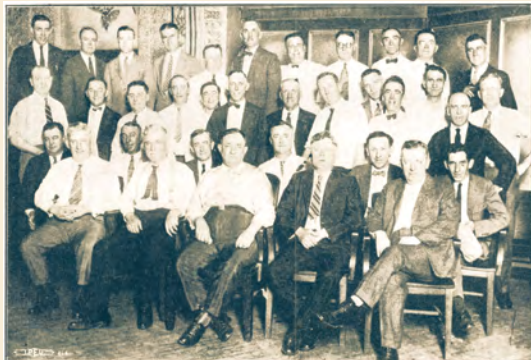
A 1925 photo of the Chicago Joint Committee, which arranged the fraternal train ride to Seattle.

Broderick already had traveled two days by train to Chicago, where Midwest rail operators set up a dedicated line for two Brotherhood Special trains that were arranged by the IBEW Chicago Joint Committee. Before departure on Sunday evening, Aug. 9, they assembled at Sherman House — Eighth District headquarters — then headed in a caravan of vehicles to Chicago's Union Station to embark. It was quite a scene: