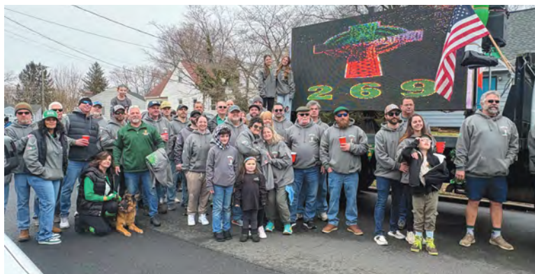
Local 269 members and their families get ready to march in St. Patrick's Day Parade in Mount Holly, N.J.

L.U. 269 (i&o), TRENTON, NJ — With parade season just around the corner, the record snowfall in New Jersey and Pennsylvania was a cause of concern for event organizers and participants alike.