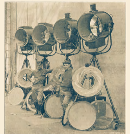
Hollywood, Calif., an exciting stop en route home for the travelers, was the workplace of other IBEW brothers, including these members pictured at Paramount Studios in 1933.

"Now into Frisco and we were subjected to more entertainment. The folks at the Golden Gate spared no efforts to make our stay among them pleasant, and to the Brothers and their ladies I wish to express my deep appreciation for our trip around that beautiful city and into quaint old Chinatown with its variety of color.