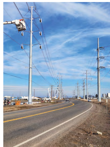
Local 125 crews from Michels Power and Sturgeon Electric Building upgrading lines in Boardman, Ore.

L.U. 125 (lctt,o,t,u&ptc), PORTLAND, OR — In the Boardman, Ore., area, line contractors are building and upgrading high-voltage transmission infrastructure to support the influx of data centers and meet regional electricity needs.