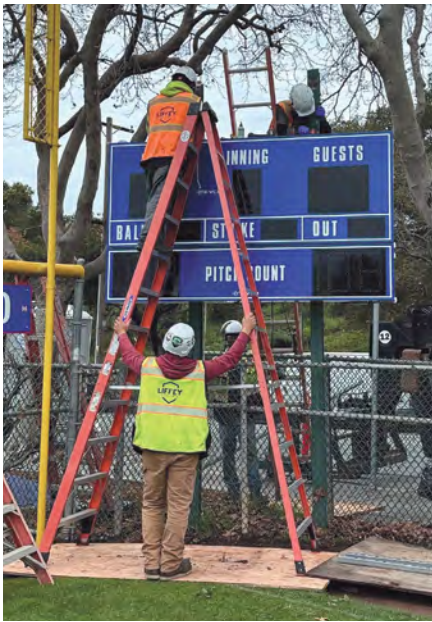
Local 617's scoreboard installation at El Camino High School in Oceanside, Calif.