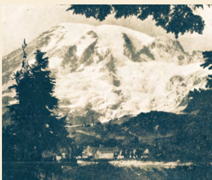
Washington's Mount Rainer — 14,410 feet above sea level — was a stunning sight for the IBEW travelers arriving from the Midwest.

"This was in truth a large family gathering, the smiling countenance of our international president indicative of perfect contentment, making everybody feel the same as himself, was conspicuous on many occasions, and when one talks of harmony — well, it was harmony personified."