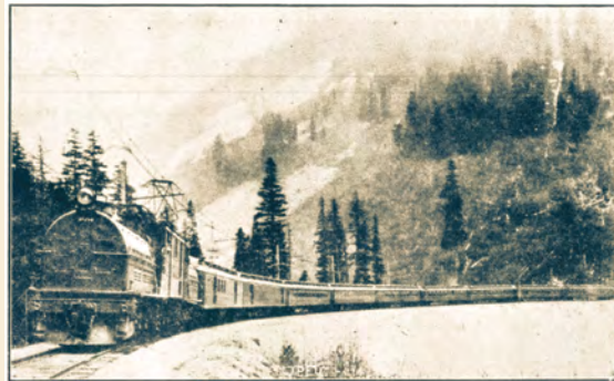
The Brotherhood Special rolls through the Rocky Mountains, a photo that would appear to be the second of the two trains, as taken by someone aboard the first.

breakfast served in the large dining room of the railway station, and the following trip around St. Paul and Minneapolis (again under police escort) was something to be proud of."