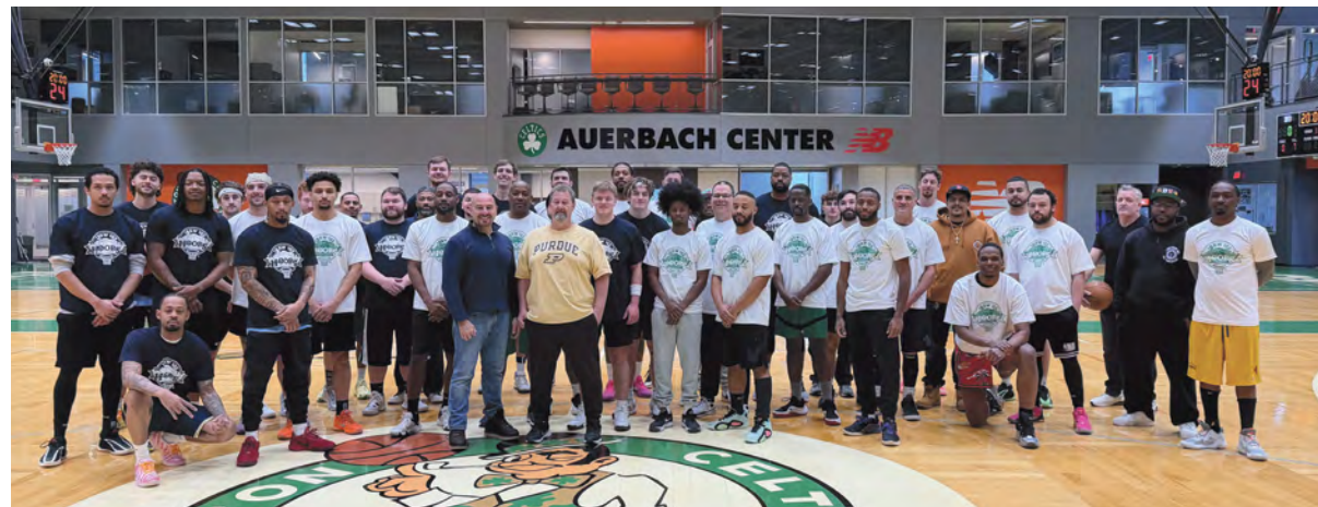
Local 103 hosted the first annual invitational basketball tournament with Indianapolis Local 481, with members ready to play!

The weekend tipped off with a welcome reception at the hall, hosted by Local 103's EWMC