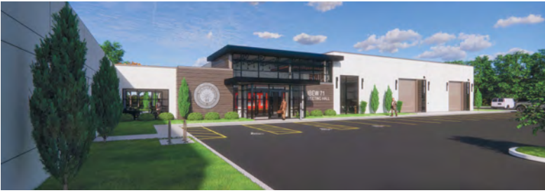
Local 71's rendering of its new meeting hall and training center.