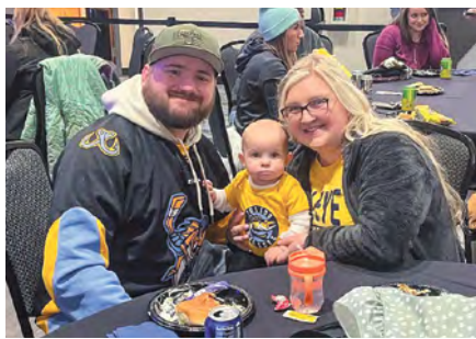
Local 245 rang in the new year with more than 600 members and their families to support the Toledo Walleye hockey team.