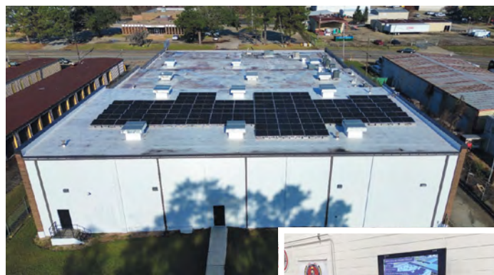
Local 995's training center has a new microgrid powered by solar energy, which improved instruction and opened it to serving as a Community Lighthouse.

"We're running our apprenticeship programs on a shoestring budget, trying to stretch every dollar as far as we can get it," he said. "That's real savings that we can spend on laptops and other materials." ■