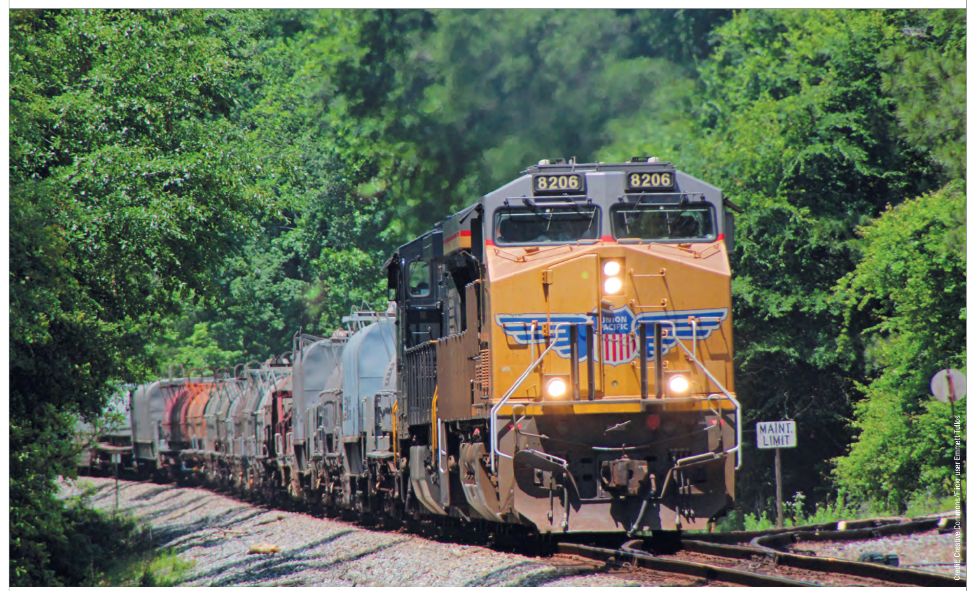
In September, the IBEW's Railroad Branch members voted to ratify a historic tentative collective bargaining agreement with the largest freight rail carriers in the U.S., including Union Pacific.