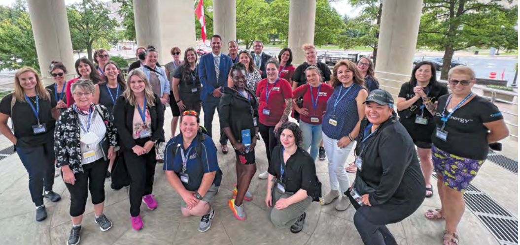
During the IBEW Women's Conference in Washington, Canadian members toured their nation's embassy and met its first woman U.S. ambassador. In the Rotunda of the Provinces, picture, they broke into "O Canada."

« Il ne s'agissait pas juste d'un autre édifice gouvernemental à Washington, c'était notre édifice et c'était si important de nous y voir et d'y voir notre histoire », dit-elle. « C'était vraiment agréable d'avoir une partie du Canada avec nous pendant que nous assistions à la conférence aux États-Unis. »