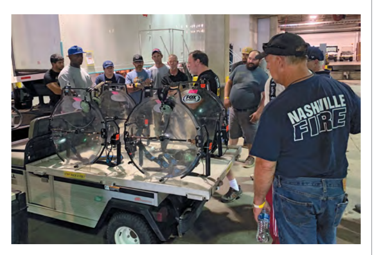
Nashville, Tenn., Local 429 members and others learned how to use a parabolic microphone during broadcast utility training.

"When Fox broadcasts a Super Bowl, because of the amount of utilities we have as members, they always ask if