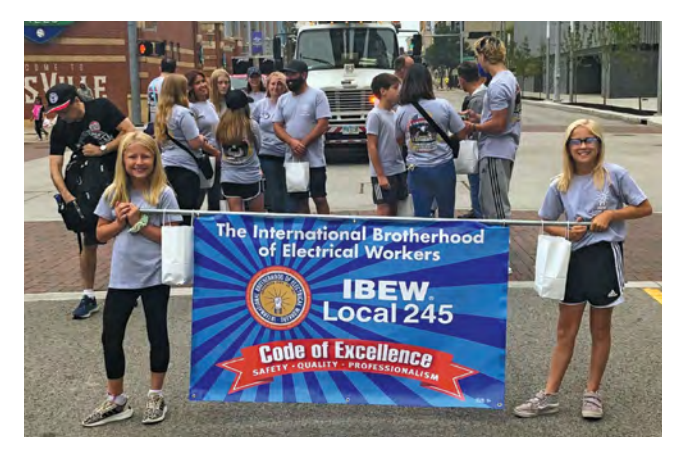
Local 245 members and families at the Toledo Labor Day Parade.

Work on the outside construction branch has