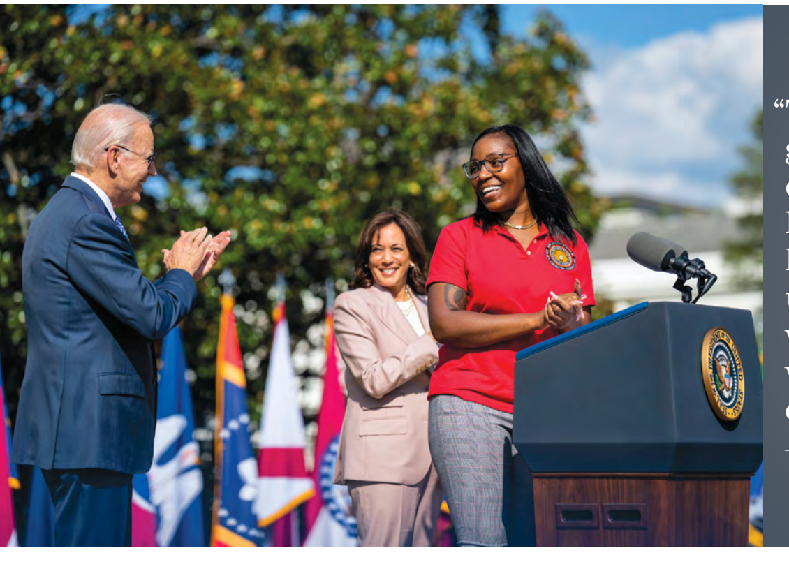
"The president gave me encouragement. He let me know that he understood how valuable the workers of our country are."

The IRA builds on other major victories: the $1 trillion American Rescue Plan, which also ensured the security of multiemployer union pensions like the