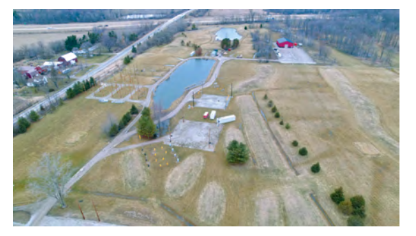
Local 17 members approved additional investment in a state-of-the-art training center to provide world-class education for current and future IBEW members.