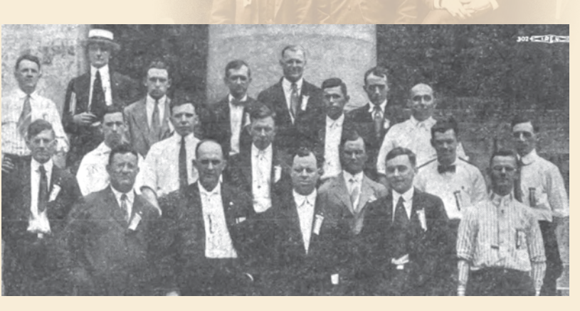
Members of IBEW System Council No. 3, pictured here, stood up to the Pennsylvania Railroad Company's formation of a company union and went on strike in 1922.

Editions of this newspaper were filled with pleas from local unions to avoid the promoters of company unions "as you would any other kind of swindler." One such tale came from the June 1922 issue, which detailed how the Western Union Telegraph Company organized their own "Association of Western Union Employees" to antagonize the Commercial Telegraphers Union of America, a legitimate trade union. When the company announced it would reduce wages to the 1914 level, the "Association" happily accepted the reduction "doubtless as an act of kindness to the company which owned it. That is how a company union operates." Corporate interests did their work well, and by 1930 IBEW member-