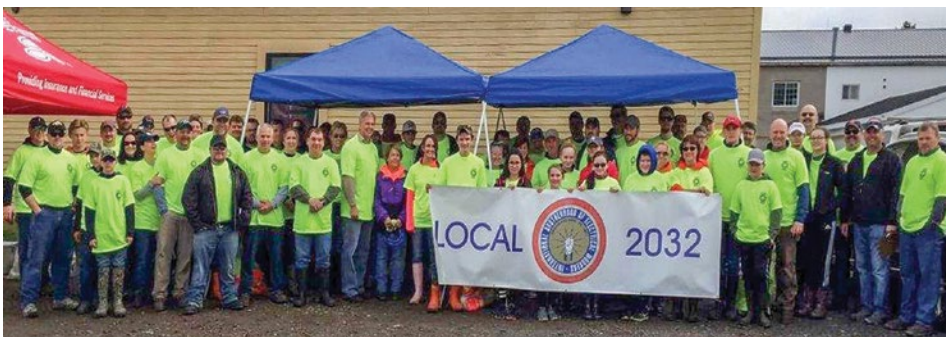
Local 2032 members and their families turn out in force to volunteer for Adopt-a-Highway cleanup project.

L.U. 1988 (mo), ALBUQUERQUE, NM — IBEW Local 1988 is part of the Metal Trades Council that conducts contract negotiations on behalf of metal trades union members employed at Sandia National Laboratories