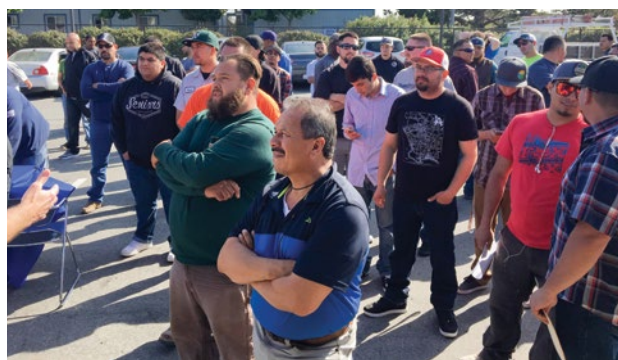
The Local 234 Job Fair on June 6 saw a great turnout.