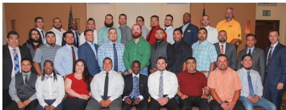
At the South Texas Electrical JATC graduation banquet in June 2017.