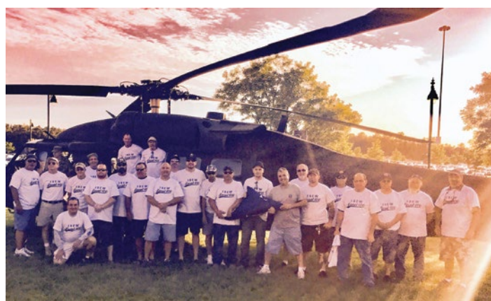
Local 400 members at BlueClaws Stadium on Military Appreciation Day.