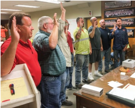
Newly elected Local 2 officers are sworn in at July 10 union meeting.