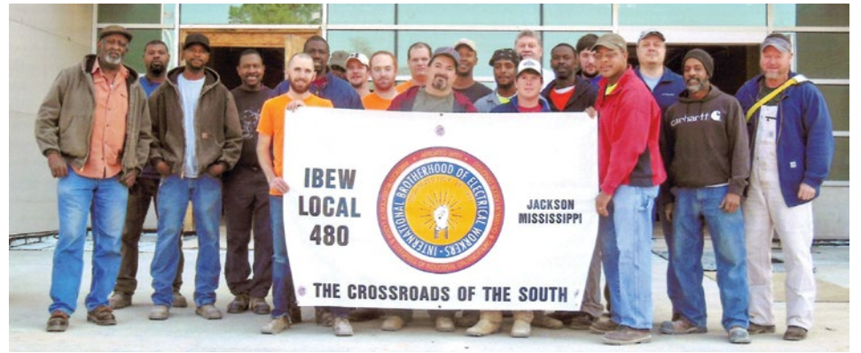
IBEW Local 480 members wired University of Mississippi Medical Center buildings.

Construction of the Stantec Tower in downtown Edmonton's Ice District, the West Valley Light Rail Transit, and Stanton Hospital (in the city of Yellowknife, Northwest Territories) as well as other commercial projects are expected to provide some employment for our members until 2018.