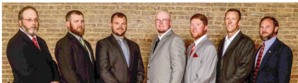
Local 558 lineman apprenticeship graduating class of 2017 with instructors.