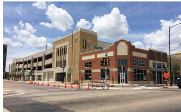
Streetscape view includes newly constructed Amarillo City Parking garage, one of several Local 602 projects.