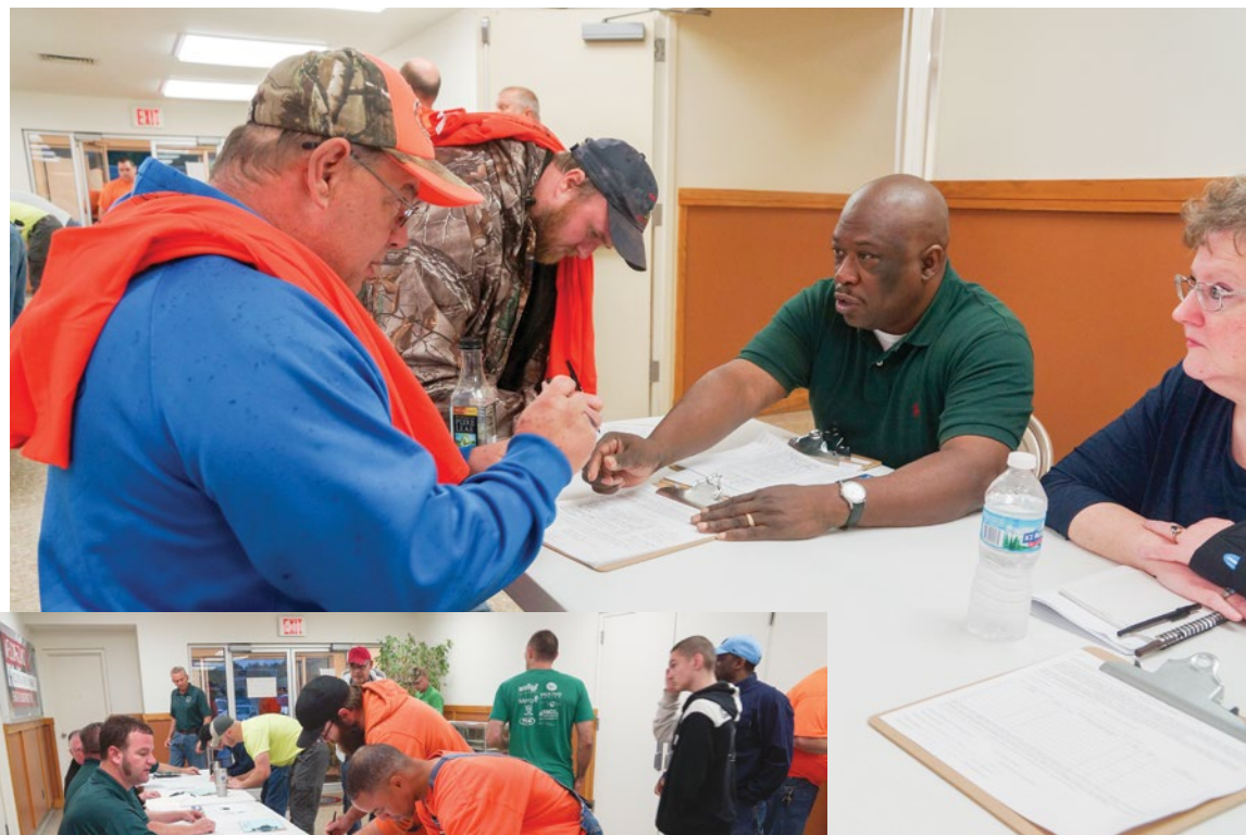
Members of St. Louis Local 1 and other building trade unions in the area sign petitions asking for a repeal of Missouri’s right-to-work law during a signature-gathering event at Local 1 headquarters.