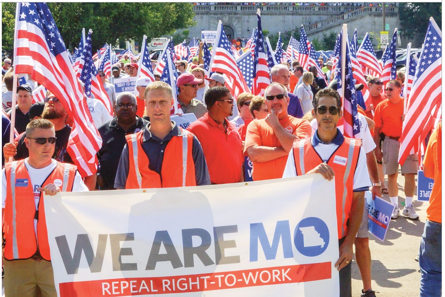
Members of Missouri unions and their allies march in front of the state capitol in Jefferson City on Aug. 18 after submitting nearly 311,000 signatures calling for a referendum on the state's right-to-work law.