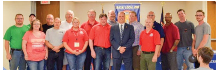
Local 292 newly elected officers.