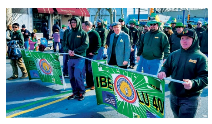
Local 400 members proudly march in Saint Patrick's Day parade.

L.U. 400 (es,i&o), ASBURY PARK, NJ — On Sunday, March 6, over 50 members gathered for the Belmar St. Patrick's Day parade. Local 400 has always had a large presence at this event, hailed as one of the biggest parades in New Jersey for the holiday.