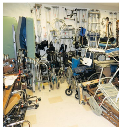
A partial view of Local 26 Retirees Club's medical equipment stockroom.

RETIREES CLUB OF L.U. 26, WASHINGTON, DC - By the time you read this, our club will probably be home from our 2016 cruise to Bermuda and the Bahamas, which left Baltimore Harbor on June 9. Plans have