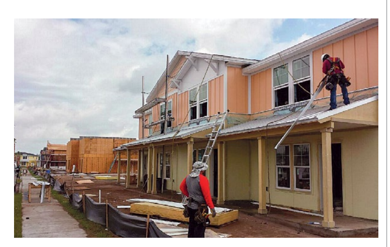
Jacksonville, Fla., Local 177 members recently helped to wire a Beaches Habitat for Humanity house in their community.

The RENEW members see it the same way. "We know we're a new group," Wolf said, "but we want to help the brotherhood, whether it's increasing our market share or just showing the community a different side of the IBEW. This is our chance to make a real difference here in Jacksonville."