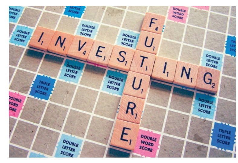
The Department of Labor issued a new rule to protect retirement investments from potential conflicts of interest.

hidden fees and commissions are necessary to serve lower-income investors. In effect, they're saying, 'If we can't scam them a little, we'll ignore them altogether.' This deceptive mentality is exactly why a new rule is needed," Naylor said.