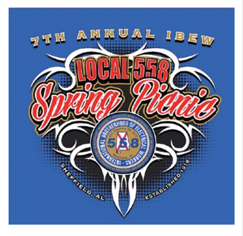
Local 558's 7th Annual Spring Picnic was a great success.