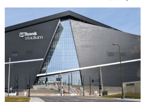
US Bank Stadium, new home of the Minnesota Vikings, constructed by IBEW Local 292 members and many other trade union workers.