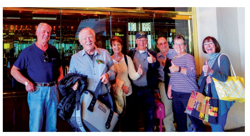
Some of the Local 595 Retirees Club travelers prepare to leave El Dorado Casino after "breaking the bank" on the club's train trip to Reno, NV.