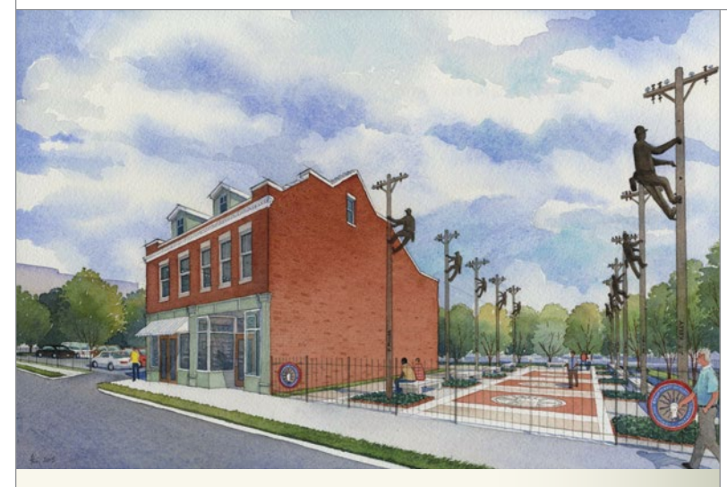
A rendering of the completed museum shows how much the project has progressed in nine months.

secured more than $1.5 million in donations from individuals and locals across the U.S. and Canada. Several locals have donated six figure sums to sponsor entire floors of the museum, and many more have donated at lower levels to sponsor everything from lineman statues in Founders Park to granite benches and engraved pavers.