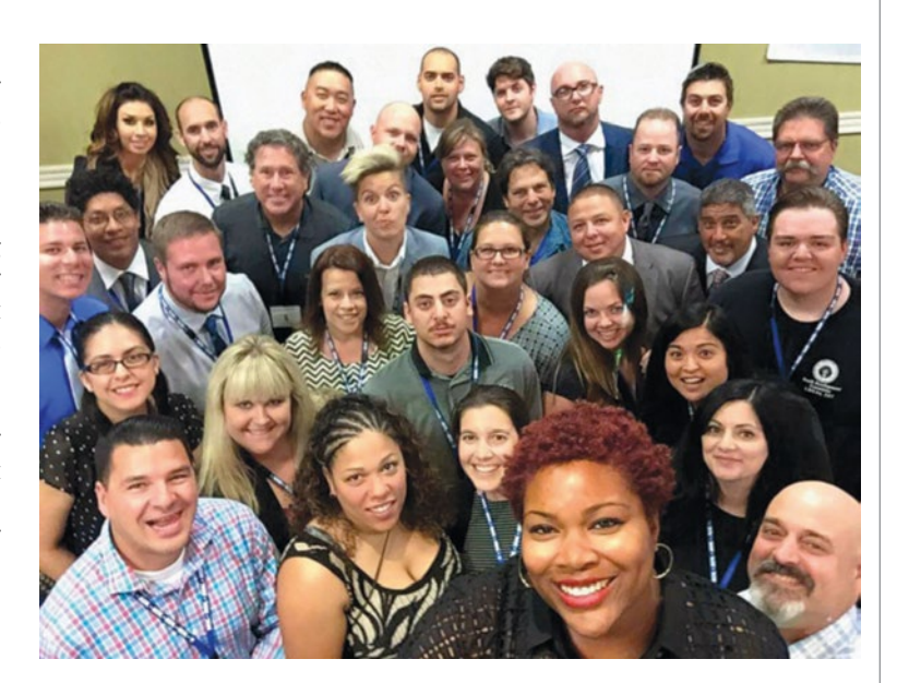
A new report says that millennials are not faring as well as other generations, and union membership is part of the solution. Shown here are Ninth District RENEW activists.

Only about five percent of people aged 16 to 24 are union members, says Generation Progress, a publication affiliated with the Center for American Prog-