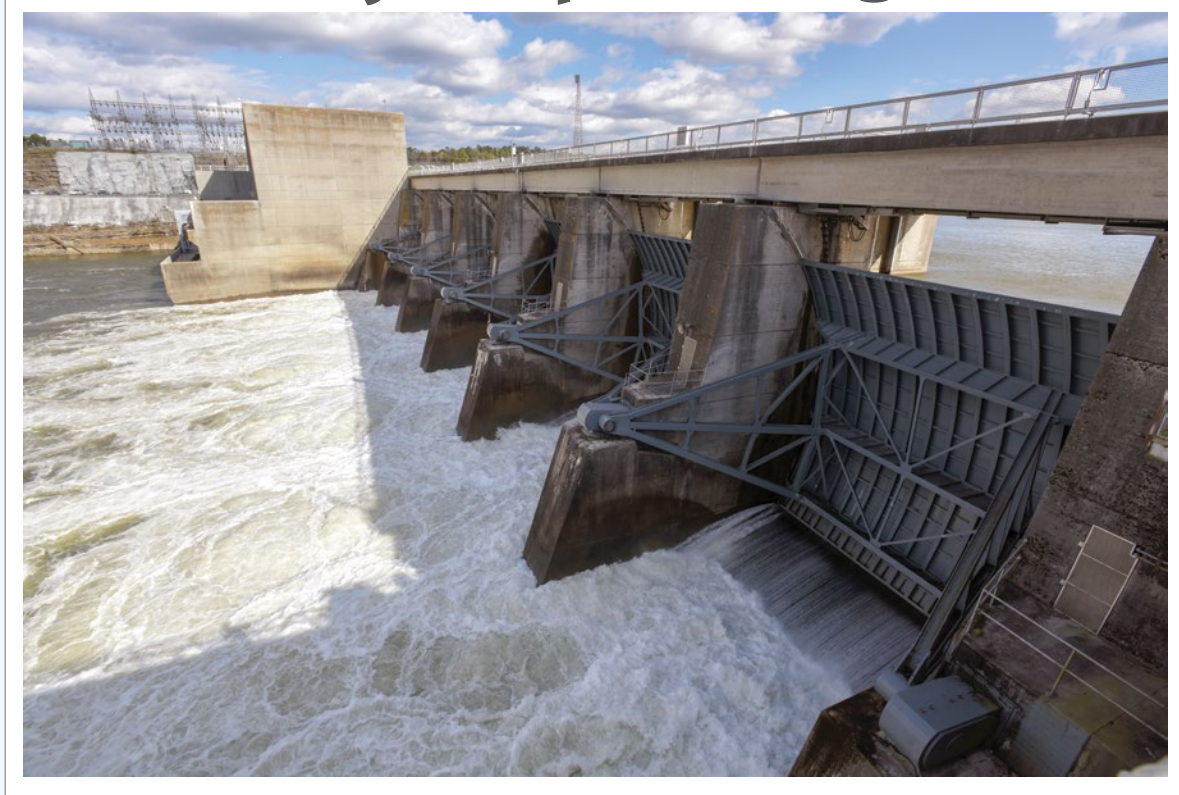
Chattanooga Local 2080 members show up for their shift – even during a historic snowstorm. It earned them the praise of the U.S. Army Corps of Engineers.

pring is in the air now, but it wasn't that long ago that "Snowzilla" dumped double-digit levels of snow across the eastern United States. For many, the January snowstorm meant a snow day with warm drinks and snowball fights.