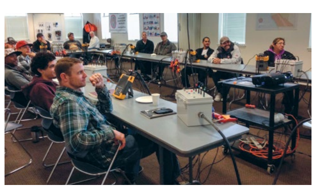
Local 234 members at a special Fluke Power Quality Meter class.

[Editor's Note: The National Joint Apprenticeship Training Committee (NJATC) rebranded in 2014