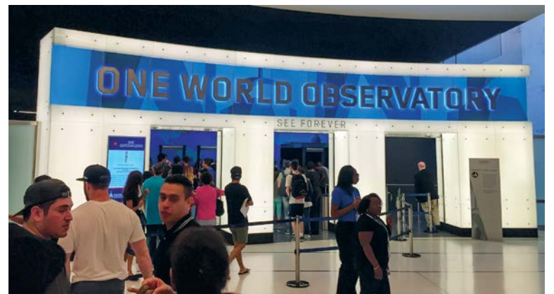
Crew members broadcast from the World Trade Center last spring for the first time since 9/11.

The crew had to arrive two days in advance of the broadcast to set up a remote control room, studio and transmission facility, temporary structures that would coordinate the video and audio components to and from the CBS Broadcast Center in nearby Hell's Kitchen, the show's home. Fiber cables had to be laid to enable these com-