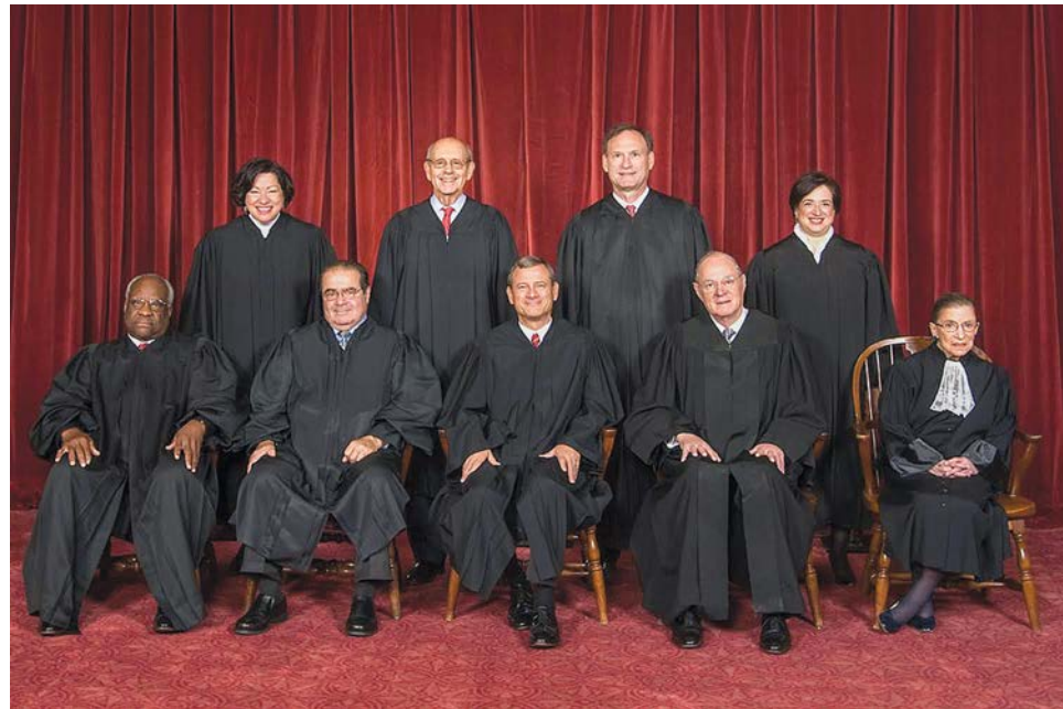
The Supreme Court ruled that the Environmental Protection Agency's 2011 rule on mercury emissions failed to factor in billions in costs to coal plants.