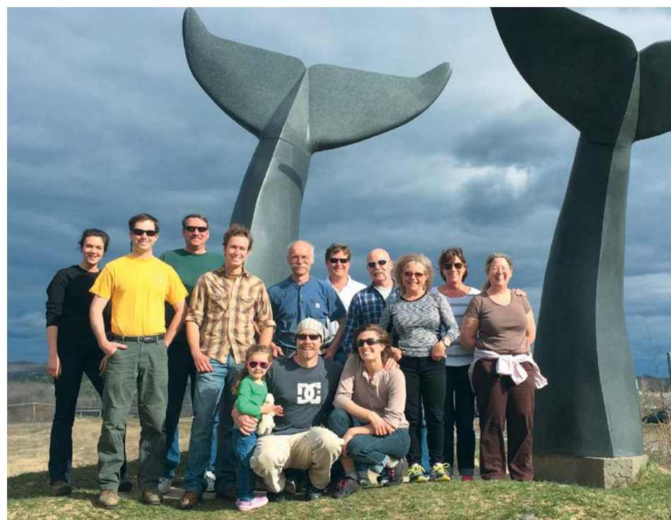
Several Local 300 members and family attend a wellness event in April.