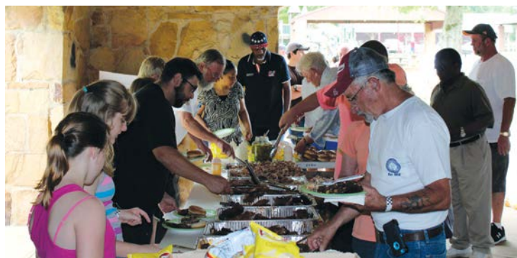
Attendees enjoy Local 558 Annual Spring Picnic.

L.U. 558 (catv,em,i,mt,o,rtb,rts,spa&u), SHEFFIELD, AL—Greetings, brothers and sisters.