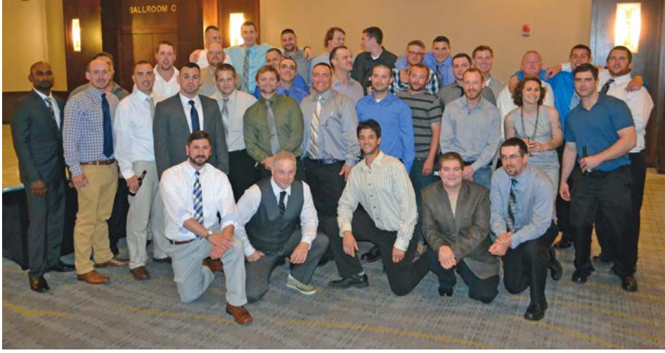
Local 236 Tri-City JATC class of 2015. [See Editor's Note in article.]