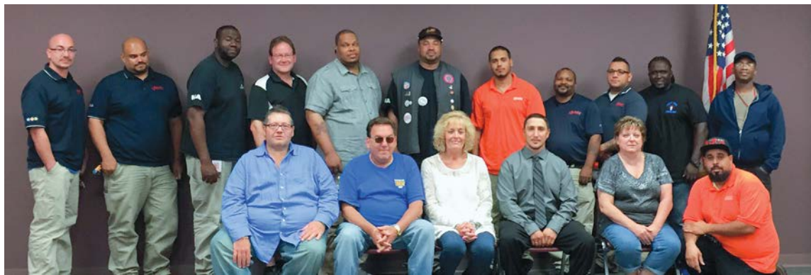
New Jersey Comcast technicians overwhelmingly voted against a proposed decertification.

The complete report can be found at www.epi.org . ■