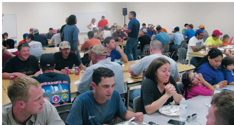
At the end-of-school-year barbecue for Local 520 apprentices.

This gathering was a well-deserved celebration of all the hard work and dedication that our brothers and sisters put forth in successfully completing another year in their apprenticeships. If looking forward to a summer break and enjoying delicious food did not put a smile on attendees' faces, the presentation of special awards and prizes did. The apprentice with the highest grade-point average was presented with a drill. Twenty-three apprentices with perfect attendance received tape measures. Apprentices with highest GPAs in each respective class year also received gift cards.