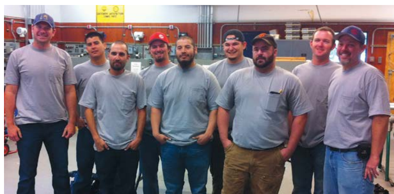
Local 100 congratulates the 2015 fifth-year apprenticeship graduating class.