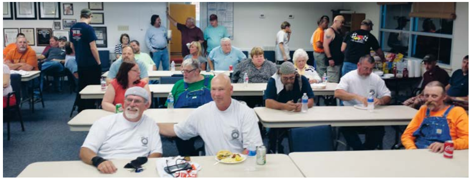
Attendees gather to celebrate the 90th anniversary of IBEW Local 760.

The IBEW and Local 760 stand for the highest