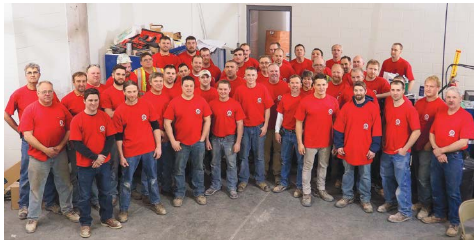
IBEW Local 110 members at an Egan Co. jobsite show their solidarity by wearing red shirts.