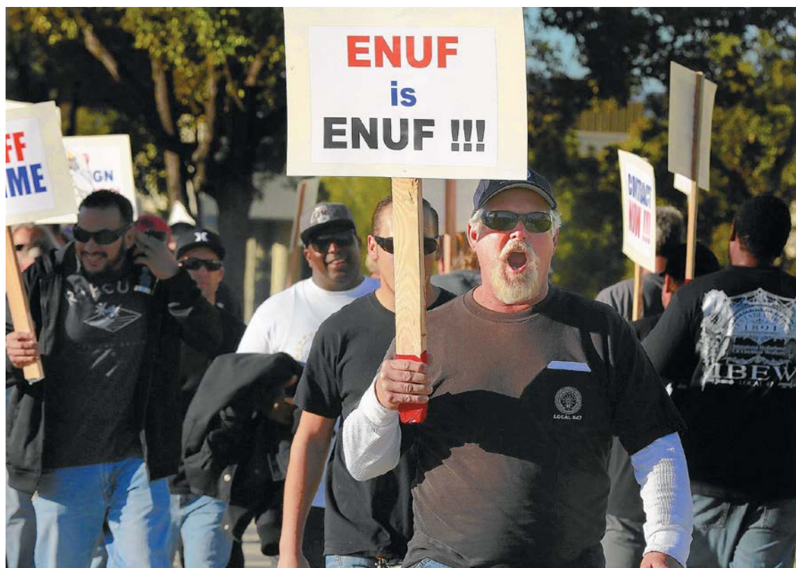
Members of Diamond Bar, Calif., Local 47 protesting Southern California Edison’s replacement of U.S. workers with foreign contractors using H1-B visas.

In a public statement, Republican Sen. Jeff Sessions of Alabama said, “SCE ought to be the tipping point that finally compels Washington to take needed