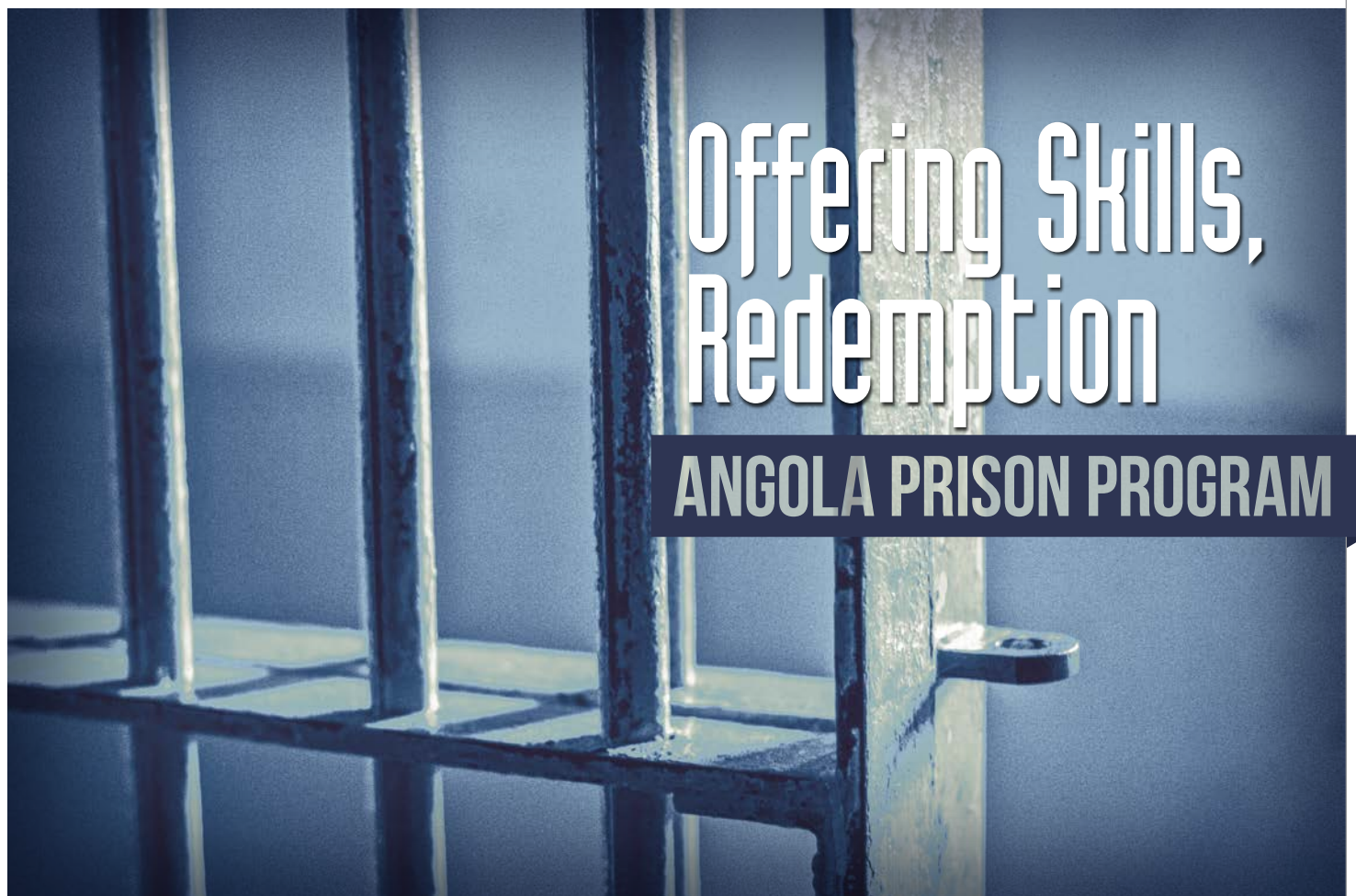
Angola, once considered the most brutal prison in the U.S., is home to a mentoring and skills training program that gives prisoners a chance to succeed after lockup.