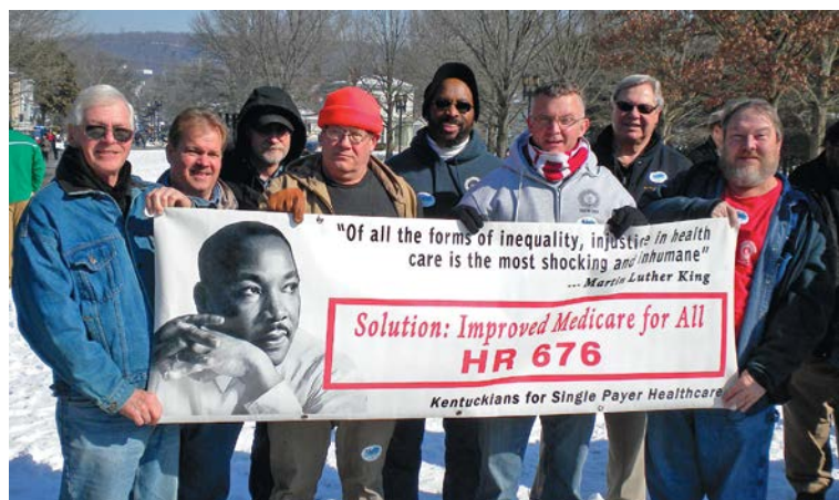
Members of Louisville, Ky., Local 369 commemorated the 50th anniversary of a pivotal civil rights march in the city.