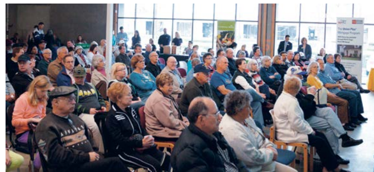
Local 595 members and spouses attend Benefits Fair.