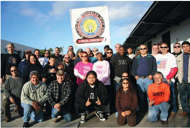
IBEW Local 11 members, friends and families volunteered for “Stamp out Hunger” 2013 food drive.