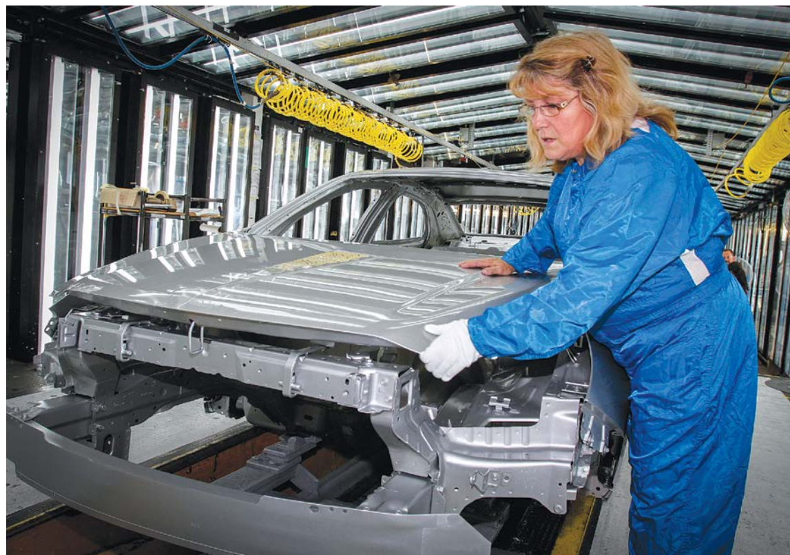
Members of Kansas City, Mo., Local 124 renovated factories for GM, above, and Ford, right. Thousands of UAW members at the facilities build the popular Ford F-150, the Chevy Malibu, the Buick LaCrosse and more.

At nearly 5 million square feet, Ford's Claycomo facility produces more cars than any other plant in the U.S. The two-square-mile structure is a field of dreams for truck lovers. Raw ingredients like sheet metal, aluminum, glass and rubber wind through a network of conveyor belts and robotic assembly arms. Here, thousands of UAW members build the F-150, the industry's top-selling pickup and