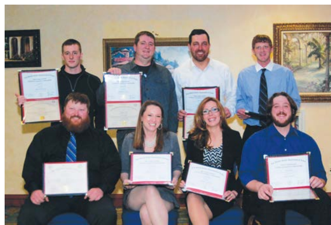
Local 141 congratulates journeyman inside wireman graduating class.