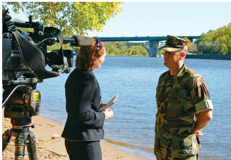
The Federal Communications Commission voted March 31 to limit TV stations' abilities to share certain services—a practice that had shed hundreds of jobs in the broadcasting industry.