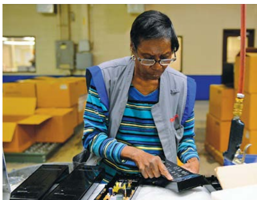
The IBEW's new national ad, 'Proudly American, Proudly Union,' shows the skills of members who manufacture goods across the U.S.

Past IBEW national commercials have been seen by millions of viewers, and have earned tens of thousands of clicks, "likes" and "shares" on social media networks like Facebook.