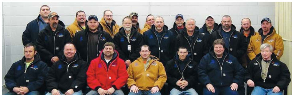
IBEW Local 1393 members are among recent graduates of the Vectren Energy apprenticeship program.