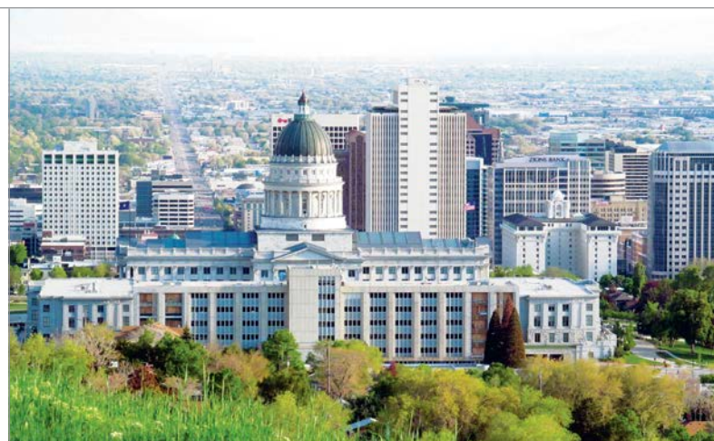
Salt Lake City is witnessing a construction boom, and much of that work is going to the IBEW, thanks to the use of alternative job classifications.