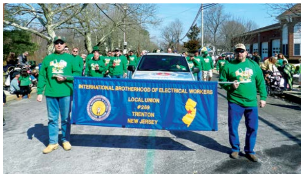
Local 269 members march in St. Patrick's Day parade in Hamilton, NJ.