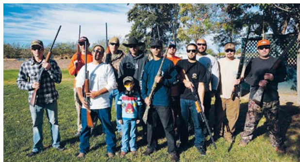
Local 477 team at 2013 clay shooting event.