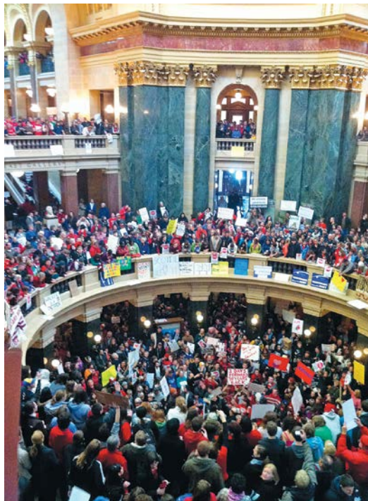
Protestors demonstrate in the Wisconsin statehouse rotunda against Gov. Scott Walker's draconian rollback of collective bargaining rights in 2011.

"Anti-union forces may have piles of cash at their disposal, but we have the