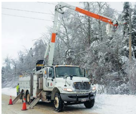
IBEW Local 37 members restore power during major winter storm.

too, just like fire and police personnel. A big thank-you goes to everyone who works so hard, sacrificing their time with family, so the rest of us can have power.