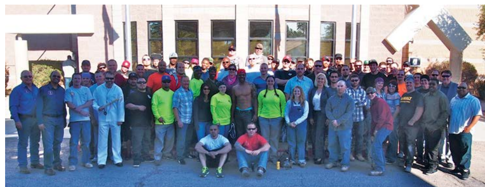
Las Vegas, NV, Local 357 apprenticeship graduating class of 2014.

In other news, our West Coast Division has three pump stations in the works. Merritt canal pump station (CR Dunn) is in the testing and startup phase. Faka Union pump station (Dynalectric) is approximately 45 percent complete. Miller pump station bid in December 2013; Cogburn Brothers Inc. is in negotiations with the general contractor at the time of this writing.