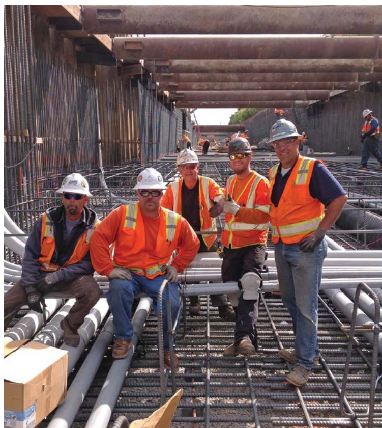
Members of San Jose, Calif., Local 332 are engaged in a four-year project extending Bay Area Rapid Transit service by 10 miles.

Local 332 electricians and travelers will be working on a $700 million project rebuilding the center's hospital, clinics and emergency department along with modernizing and expanding the Lucile Packard Children's Hospital and the school of medicine. The new facility, able to withstand a major earthquake, will incorporate the latest in operating and emergency room technologies.