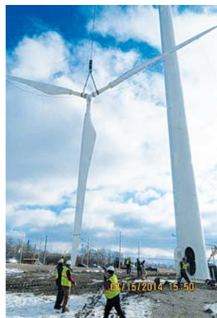
Local 697's wind turbine installation.

Even more importantly, please register to vote and vote your pocketbook in the primary and in November! Without work, it will be hard to be worried much about anything else, right? In 2015, an attempt to repeal the prevailing wage will happen, so please