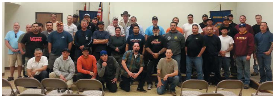
IBEW Local 47 outside construction members attend a recent unit meeting.