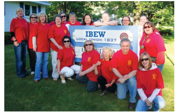
Local 1837 Customer service representatives celebrated their anticipated victory on the eve of an NLRB election last June.