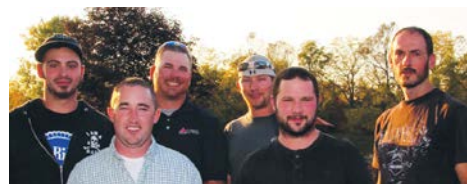
Local 241 apprentice graduating class of 2013.