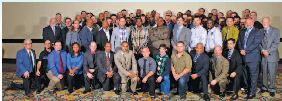
Atlanta, GA, Local 613 apprentice graduating class of 2012.

it was still a great success. Each year the party committee does an outstanding job. Thanks, guys.