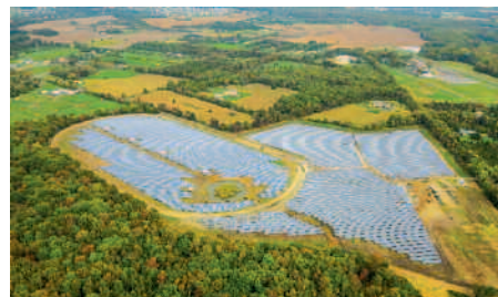
Medford Solar Inverter installation, an IBEW Local 351 project with phases I and II completed.