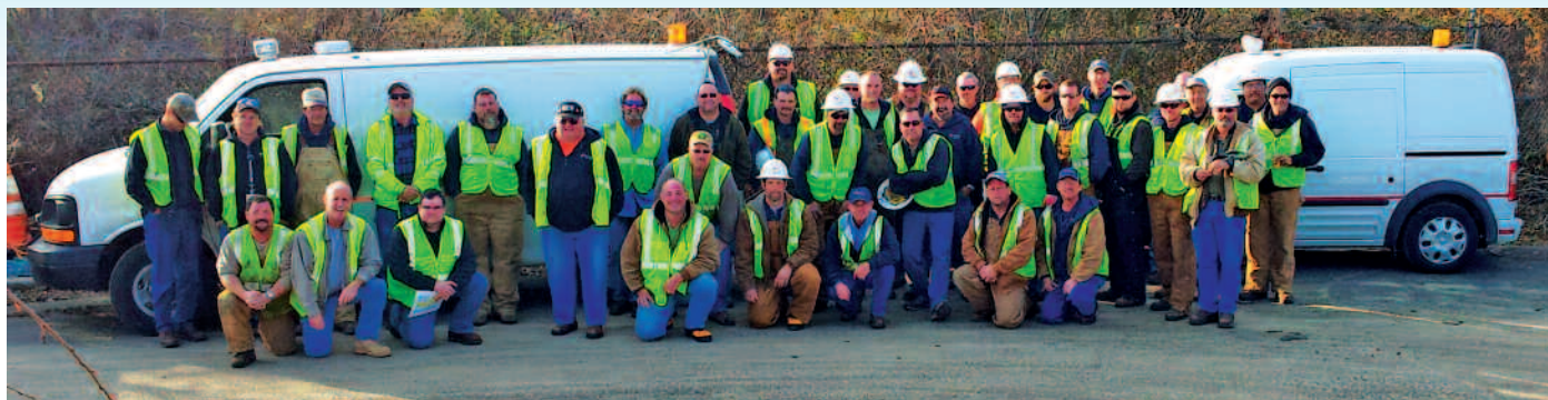
A group of Local 1393 members at Vectren Energy mobilized to assist recovery when Hurricane Sandy struck.

The devastating impact of Superstorm Sandy has at this writing mobilized our brothers and sis-