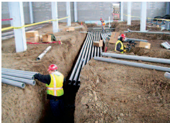
Four hundred electricians worked long hours to construct the 955,000-square-foot Chobani yogurt plant in Twins Falls, Idaho, in just 10 months.

benefits 50 percent greater in the eastern counties than in the western quadrant where Chobani broke ground. Local 449 negotiated to increase wages $4-per-hour and won double-time for overtime hours, attracting travelers from Las Vegas and other jurisdictions.