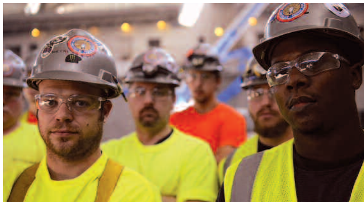
Despite the worst economic crash in decades, the IBEW regained its pre-recession market share last year.