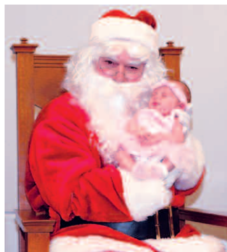
A new addition to the IBEW Local 617 family attends holiday party.