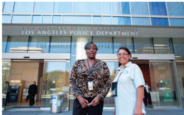
Professional employees with the city of Los Angeles are the newest members of Local 11 after the independent Engineers and Architects Association voted to join the IBEW in January.