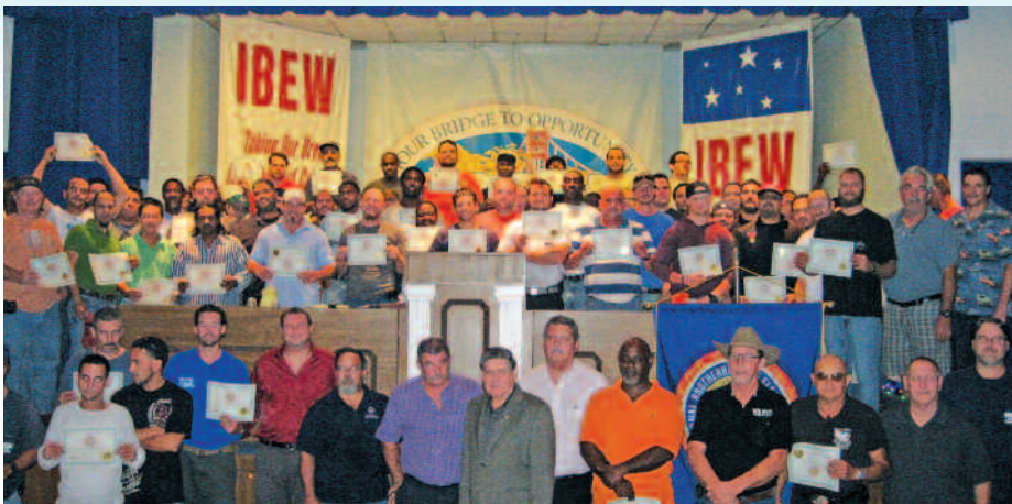
Some of the Local 349 members who volunteered their help during the 2012 election season.

Brotherhood. Take pride in your work and pride in yourself. The work we do is a reflection of ourselves and our union. Teach and lead by example. We are the union. Make those who came before us proud.