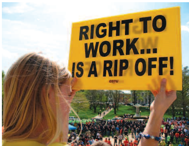
Working people are mobilizing to defend their rights against right-wing attacks.

But that changed over the summer. Right-wing billionaires like the Koch brothers and Washington, D.C.-based antiunion organizations like Americans for Prosperity and the Club for Growth spent millions of dollars on radio and TV