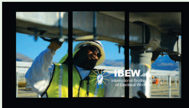
Millions of viewers have already seen the IBEW’s TV ads, which are currently running on more than five networks.

Last year, the IBEW ran ads during NFL games. One of them, “The Comeback,” showed IBEW members building America’s infrastructure, fueling the country’s economic recovery.