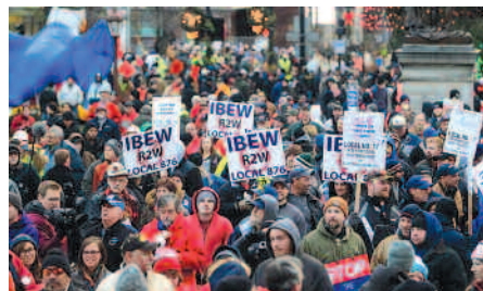
IBEW members from Locals 17 and 876 hold up placards at a union-wide rally in Michigan.