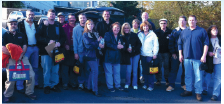
State of Washington IBEW Labor Neighbor volunteers.