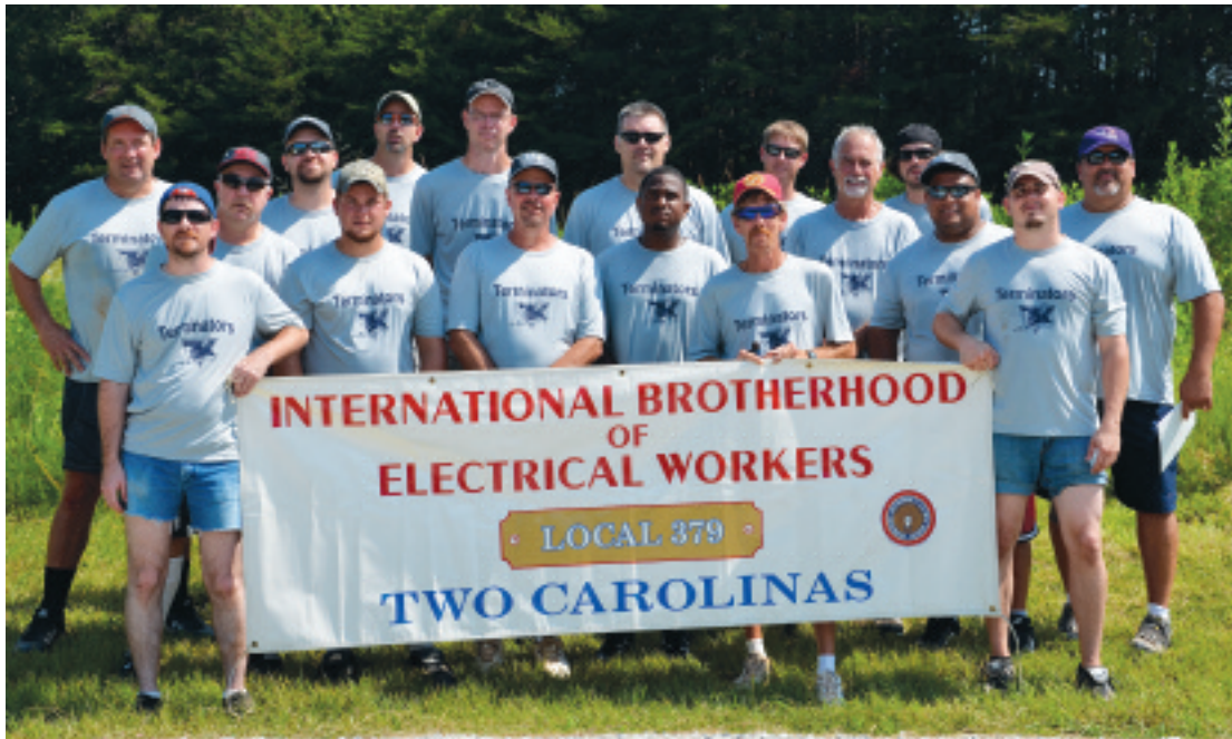
Charlotte, N.C., Local 379 members—pictured here before an area softball game—work at Oconee Nuclear Power Plant in western South Carolina. Their on-the-job successes have impressed potential signatory contractors in the region, organizers say.