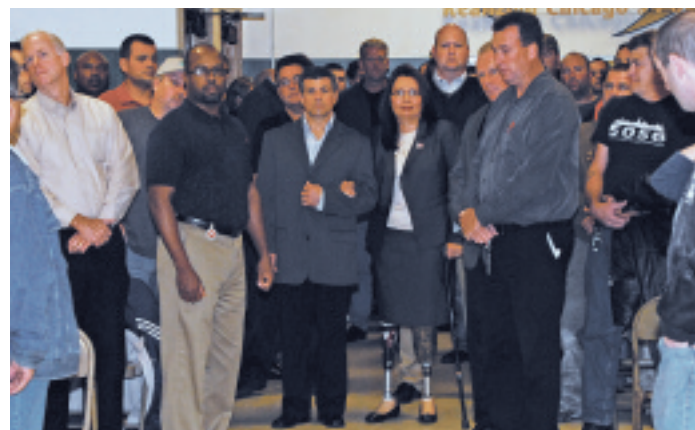
Then-candidate Tammy Duckworth, who won election to the U.S. House of Representatives, is escorted to Chicago Local 134’s October 2012 union meeting.

These past 16 months, monthly meeting attendance and member enthusiasm is at an all-time high. We are empowered and motivated.