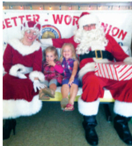
The Local 756 Kids Christmas Party of 2012 was great fun for all.