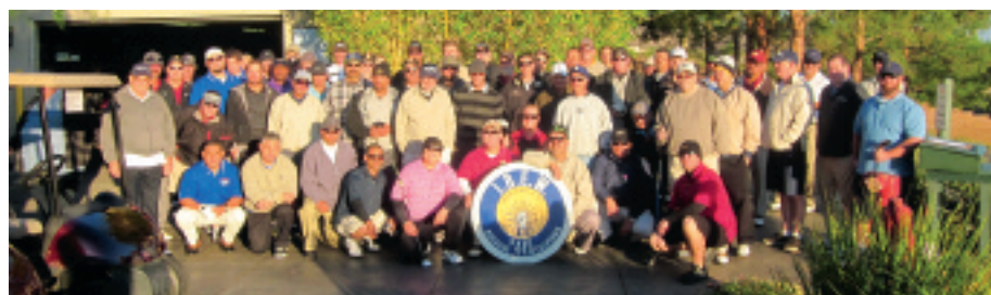
Participants attend fourth annual Riverside, CA, Local 440 Golf Turkey Shoot.

Over the year 2012, Local 440 put together various clubs to build camaraderie. We are utilizing