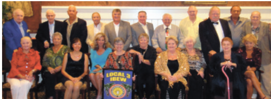
Local 3, SWFL Chapter, Retirees Club members take time out from dancing and festivities at the holiday party to pose for a group photo.