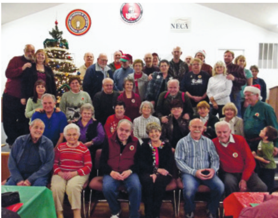
Greetings from Local 291 Retiree Club, where all are welcome.