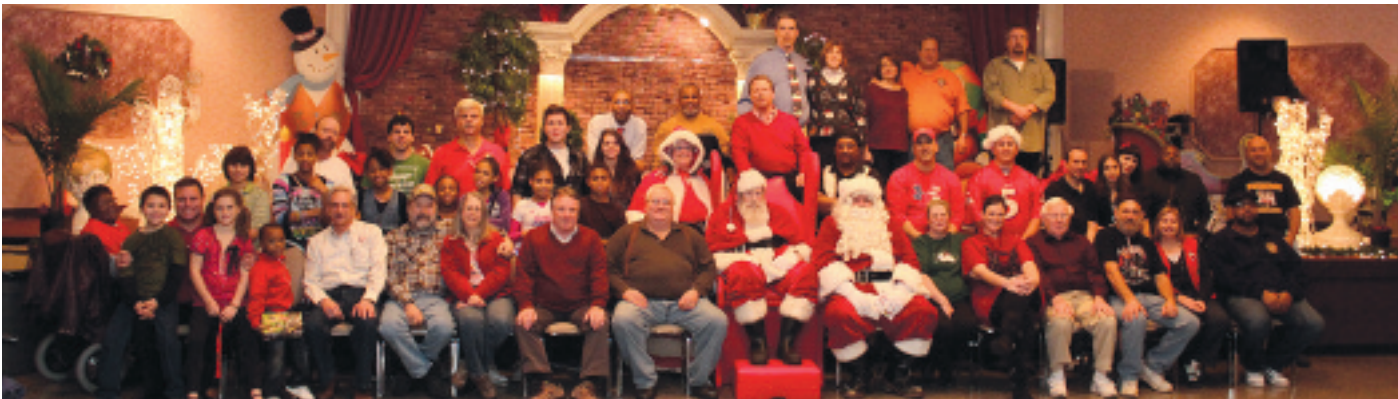
Baltimore Local 24's annual Children's Christmas Party was a great success.