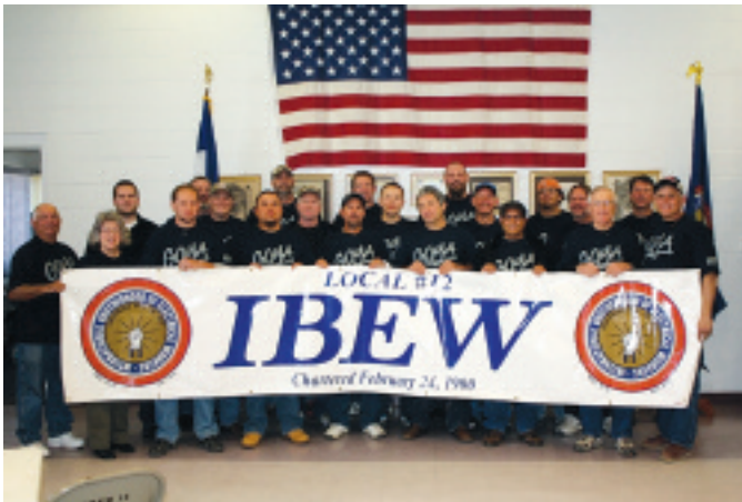
Local 12 volunteers participate in Member to Member outreach training.