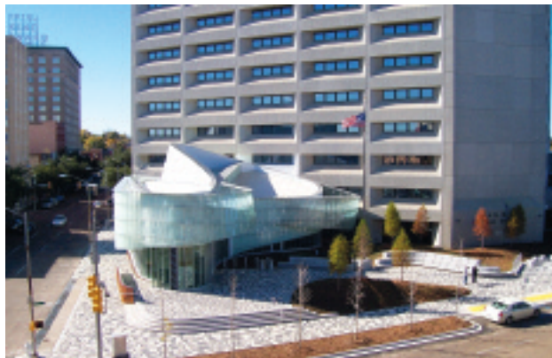
IBEW Local 480 members worked on the Dr. A.H. McCoy Federal Building modernization project in Jackson, MS.

Start-up work has been completed at the idled Conoco Refinery, which has reopened as Monroe Energy, a subsidiary of Delta Airlines, Inc. Work is set to begin in the spring of 2013 at the