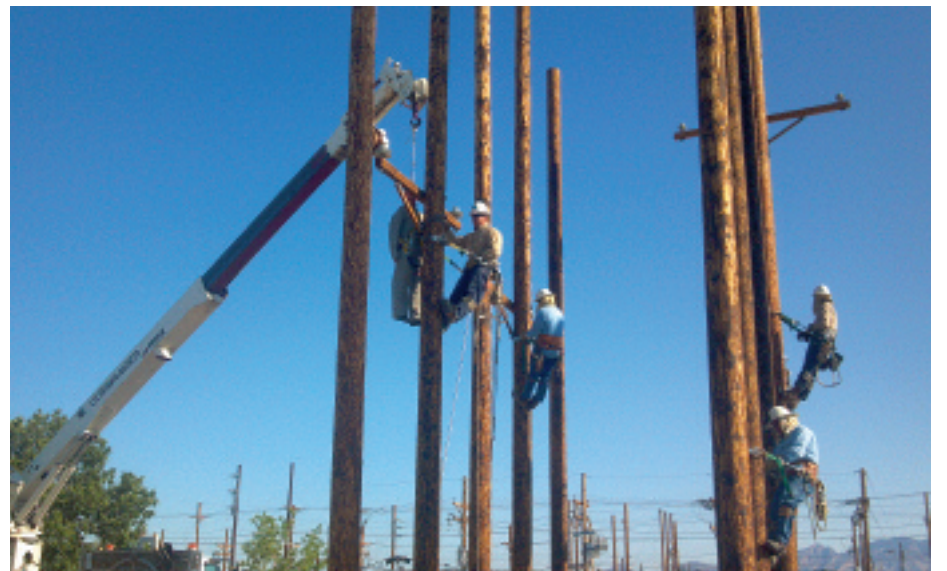
IBEW Local 1116 Tucson Electric Power linemen perform a yearly practice of Pole Top Rescue procedures at the Ken Saville Training Center.