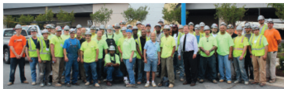
IBEW Local 24 members successfully completed the first phase of the Maryland Live Casino construction project.

BK Truland was the union electrical contractor