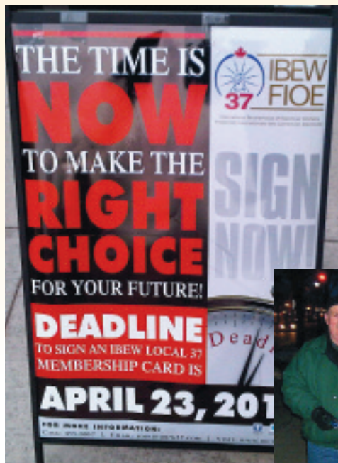
Fredericton, New Brunswick, Local 37 helped nearly 200 professionals at NB Power win a voice on the job.