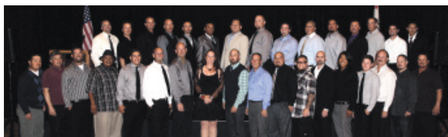
Local 440 congratulates the 2012 apprentice graduating class.

This group epitomized true baseball fans and Local 494 was fortunate to host such a wonderful event on behalf of the local membership. The Special Olympics motto is: "Let me win. But, if I