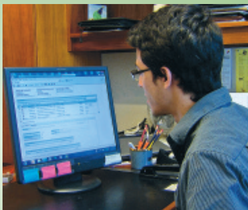
New IBEW organizing software makes finding out about upcoming construction projects and organizing campaigns in your area as easy as clicking a mouse.

OARS: The Organizing Accountability Reporting System is an online program that lets organizers from British Columbia to Florida share information on IBEW campaigns in their area—from upcoming elections to reports on union-busting activities. IBEW organizers can now share information straight from the field with their fellow organizers throughout the United States and Canada, giving union drives a big boost. ■