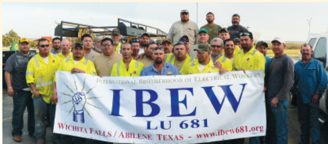
New members of Wichita Falls, Texas, Local 681 celebrate their improved wages, benefits and safety conditions after they left nonunion line construction companies to work for signatory contractors.

"We were being hopeful," says Boone. Some local and state nonunion contractors couldn't get bonding to snag 100-mile line construction projects. But it wasn't enough just to get larger signatory contractors into town.