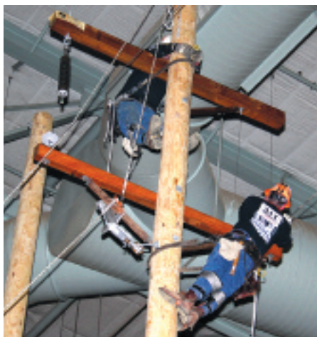
IBEW Local 702's 2nd Annual Lineman Rodeo Championship.