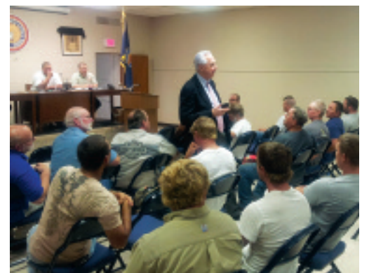
IBEW Int. Pres. Edwin D. Hill speaks with members at a Local 304 construction unit meeting.

Employees at the Westar Energy Power Plants reached two very important and first-time milestones. As of March 11, the 225 represented employees at