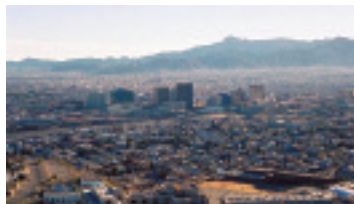
Downtown El Paso, Texas, is undergoing a construction boom.