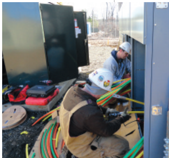
By utilizing alternate classifications, Little Rock, Ark., Local 295’s signatory contractors are winning more bids on projects and are getting journeymen off the benches.

But IBEW leaders in the Natural State are succeeding in spite of towering obstacles. One roadblock had come from lower-paying, nonunion contractors who were undercutting signatory contractors’ ability to submit competitive bids. By putting in place the Arkansas Recovery Agreement, which created alternate classifications to allow for a more flexible crew mix, signatory contractors are securing more and more work.