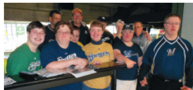
IBEW Local 494 hosts Special Olympians from Wauwatosa, WI.

Take journeyman upgrade classes, not because