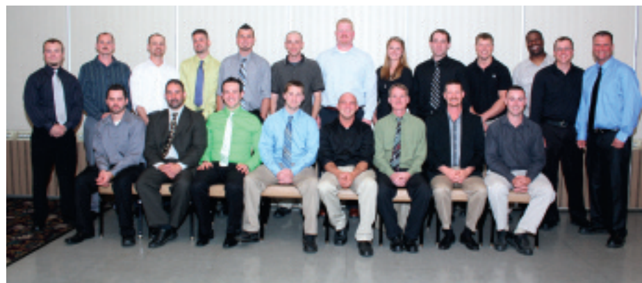
Local 306 congratulates the class of 2012 apprentice graduates.

L.U. 364 (catv,ees,em,es,i,mt,rts&spa), ROCKFORD, IL—This spring, Inside and VDV apprentices topped out and became new journeymen in their classifications. This year's Inside class is the first to graduate with an associate degree from Rock Valley College. Of 13 members who graduated, seven received honors and three received high honors! This year's co-