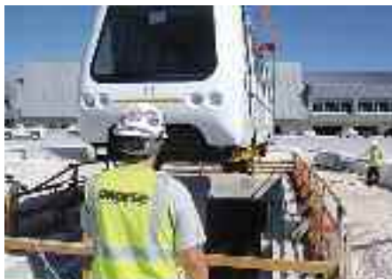
IBEW Local 357 members installed six Bombardier electric tram cars in the new ATS Tunnel at McCarran International Airport.