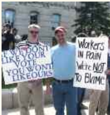
Workers still need to make their voices heard.

How? Say your city is going to put up a new building, and city hall wants public input. Go to meetings and ask the council, "Are you willing to use responsible builder language? Use a project labor agreement? Hire local labor?" Talk with your business manager to help craft your message. And