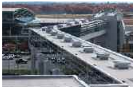
IBEW Local 99 members worked on construction of the InterLink transportation hub at T.F. Green Airport in Warwick, RI.