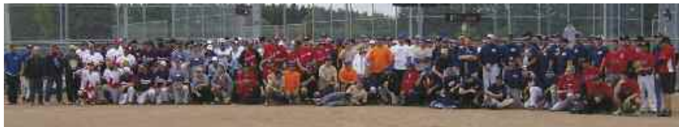
Local 1739 hosted the 2010 IBEW OPC baseball tournament in Barrie, Ontario, Canada.