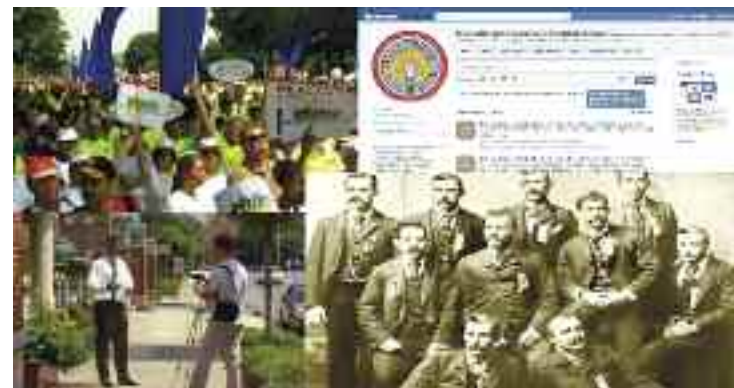
The IBEW was singled out for its work on video and social networking.

IBEW's social media and video projects received several awards at the International Labor Communication