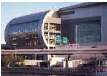
IBEW Local 369 members helped build the KFC Yum Center, shown here three weeks before it opened.