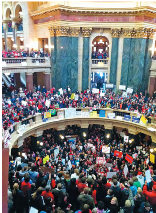
Protestors demonstrate in the Wisconsin statehouse rotunda against Gov. Scott Walker's draconian rollback of collective bargaining rights in 2011.

"Anti-union forces may have piles of cash at their disposal, but we have the