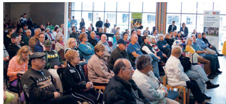
Local 595 members and spouses attend Benefits Fair.