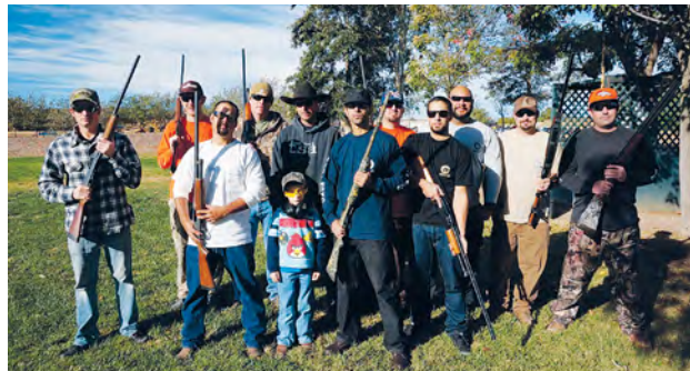
Local 477 team at 2013 clay shooting event.