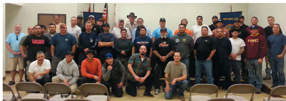
IBEW Local 47 outside construction members attend a recent unit meeting.