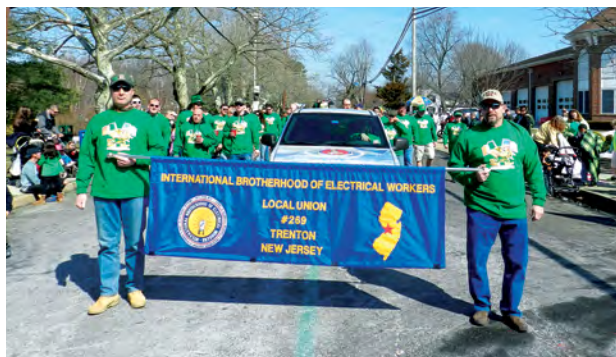
Local 269 members march in St. Patrick's Day parade in Hamilton, NJ.