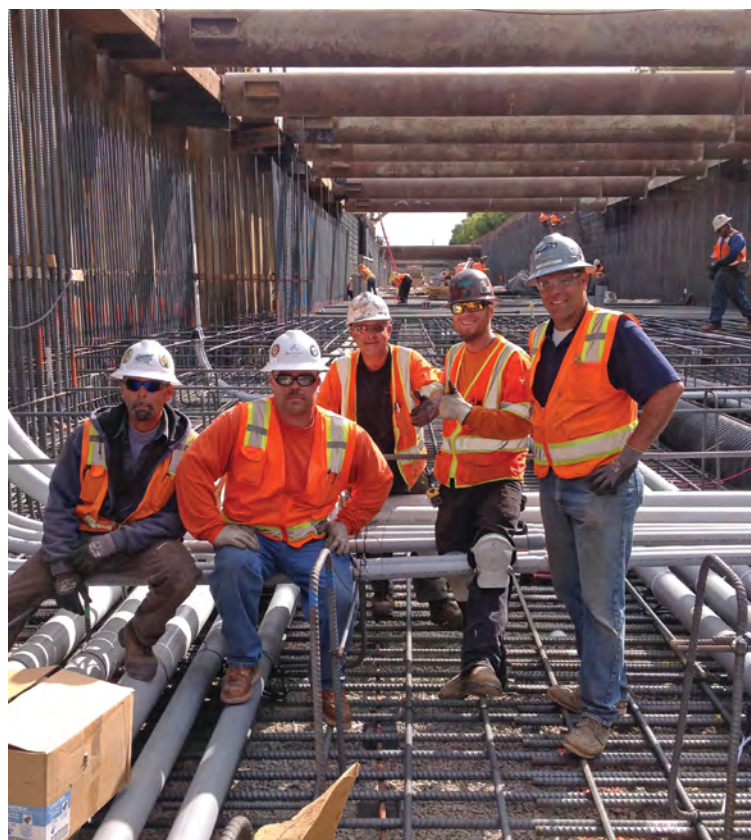
Members of San Jose, Calif., Local 332 are engaged in a four-year project extending Bay Area Rapid Transit service by 10 miles.

Local 332 electricians and travelers will be working on a $700 million project rebuilding the center's hospital, clinics and emergency department along with modernizing and expanding the Lucile Packard Children's Hospital and the school of medicine. The new facility, able to withstand a major earthquake, will incorporate the latest in operating and emergency room technologies.