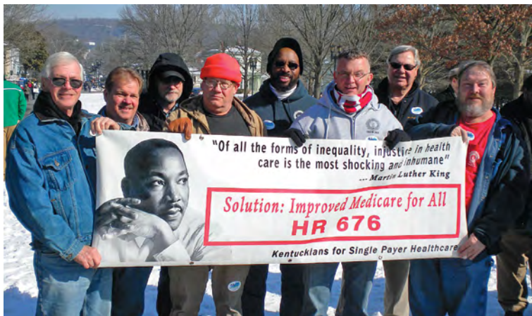
Members of Louisville, Ky., Local 369 commemorated the 50th anniversary of a pivotal civil rights march in the city.