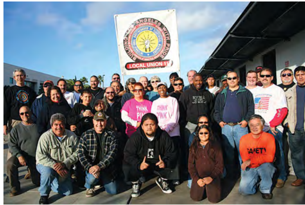
IBEW Local 11 members, friends and families volunteered for "Stamp Out Hunger" 2013 food drive.