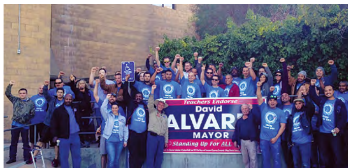
IBEW Local 569 volunteers rally for political campaign of David Alvarez.

L.U. 569 (i,mar,mt,rt&spa), SAN DIEGO, CA—We had a great volunteer turnout for the recent special election for mayor of San Diego. Our membership showed up in full force to carry the message about the importance of electing a mayor who supports middle-class working families. We enjoyed the participation of journeymen and apprentices from both our Inside and Sound Units. Although we didn't get the results we had hoped for in the election, we are very proud of