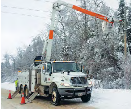
IBEW Local 37 members restore power during major winter storm.

too, just like fire and police personnel. A big thank-you goes to everyone who works so hard, sacrificing their time with family, so the rest of us can have power.