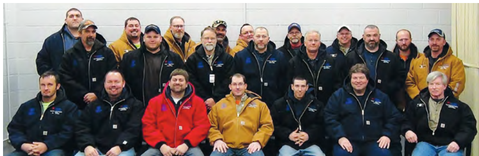
IBEW Local 1393 members are among recent graduates of the Vectren Energy apprenticeship program.