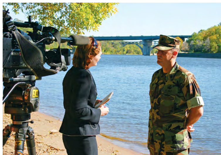
The Federal Communications Commission voted March 31 to limit TV stations' abilities to share certain services—a practice that had shed hundreds of jobs in the broadcasting industry.