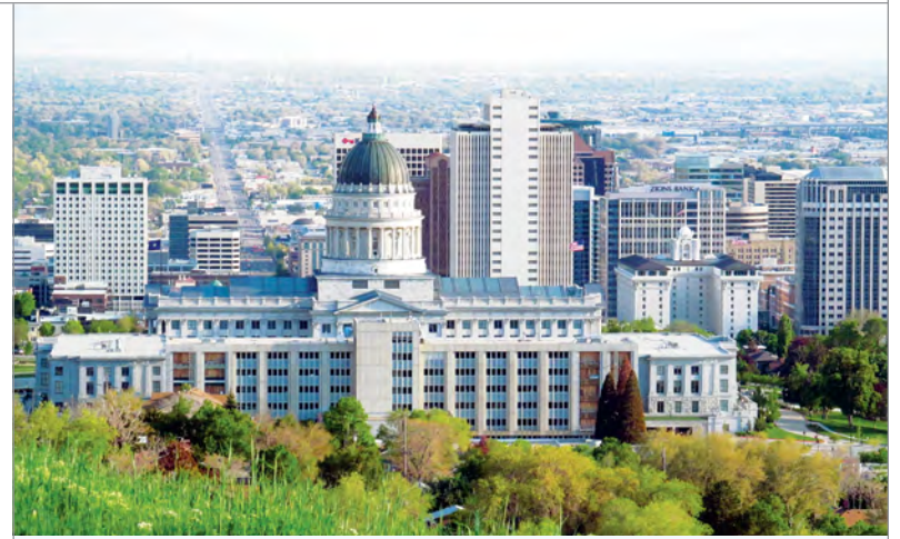
Salt Lake City is witnessing a construction boom, and much of that work is going to the IBEW, thanks to the use of alternative job classifications.