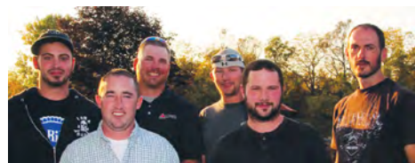
Local 241 apprentice graduating class of 2013.