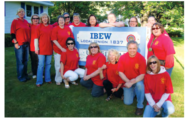
Local 1837 Customer service representatives celebrated their anticipated victory on the eve of an NLRB election last June.