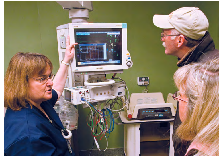
The IBEW/NECA Family Medical Care Plan is seeing strong and steady growth as IBEW locals and employers from across the United States are turning to it to meet their health care needs.

Bradley says that the average rise in plan contribution rates through 2015 will be 5 percent yearly, which is less than half the increase seen in most other private