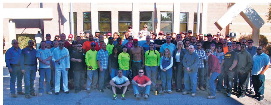
Las Vegas, NV, Local 357 apprenticeship graduating class of 2014.

In other news, our West Coast Division has three pump stations in the works. Merritt canal pump station (CR Dunn) is in the testing and startup phase. Faka Union pump station (Dynalectric) is approximately 45 percent complete. Miller pump station bid in December 2013; Cogburn Brothers Inc. is in negotiations with the general contractor at the time of this writing.