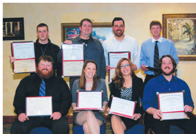
Local 141 congratulates journeyman inside wireman graduating class.