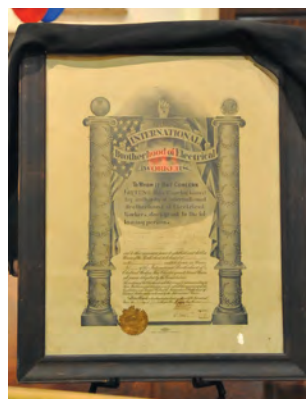
IBEW Local 681 charter.