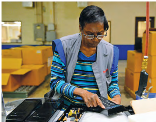
The IBEW's new national ad, 'Proudly American, Proudly Union,' shows the skills of members who manufacture goods across the U.S.

Past IBEW national commercials have been seen by millions of viewers, and have earned tens of thousands of clicks, "likes" and "shares" on social media networks like Facebook.