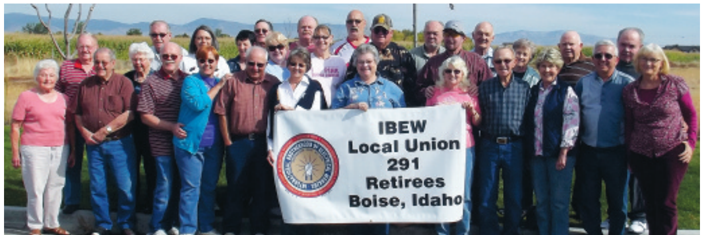
The Local 291 Retirees Club welcomes all to join the club.

We hope 2012 brings renewed economic and political conditions to benefit our brothers, sisters and nation. Buying American can help our situation. Find a shirt, shoes, groceries etc. made, grown, packed or assembled in the USA. We might take a