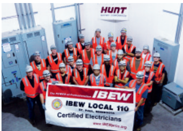
IBEW Local 110 electricians gather at the Union Depot project jobsite.