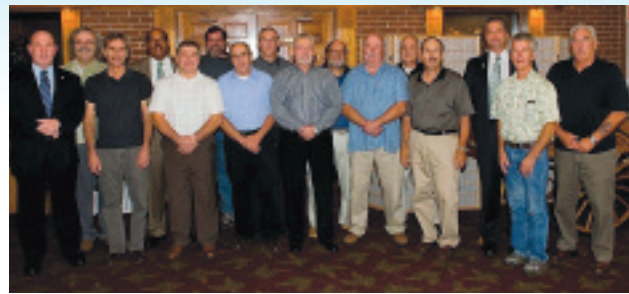
Local 90 members attend annual Retirement/25-Year Pin Dinner.