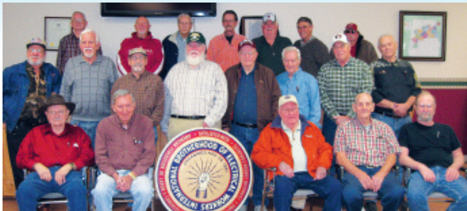
Local 136 retirees attend a meeting.