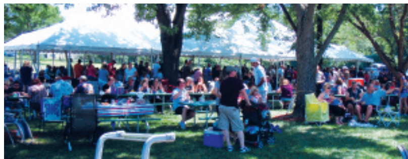
Attendees from Locals 412, 1464 and 1613 gather for Annual IBEW Picnic.