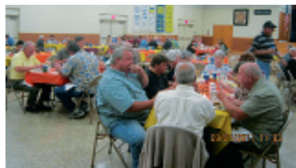
Local 1 retirees gather with friends at buffet luncheon.