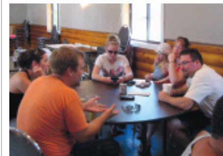
Local 498 members and their families visit after a great meal at the annual summer picnic.