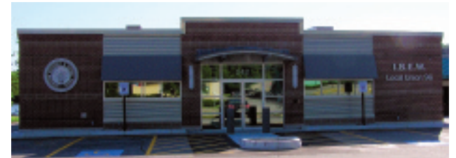
IBEW Local 96 moved to its new union hall.

L.U. 96 (i), WORCESTER, MA—We've moved! Local 96 moved to our new home, at 242 Mill St., Worcester, MA 01602. Thanks to all members for their patience through construction. The building was worth the