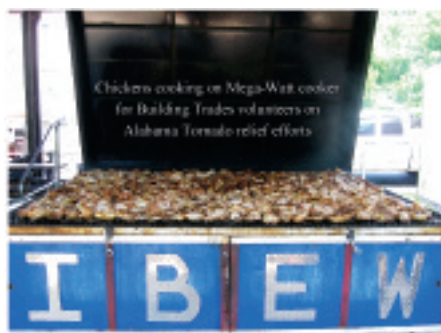
IBEW Local 136 has helped support tornado relief efforts in Alabama.