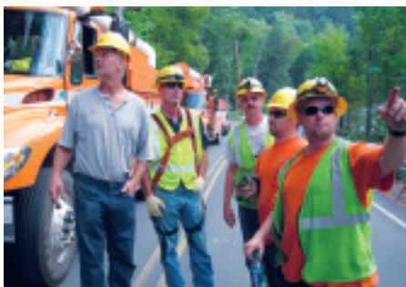
IBEW utility workers in Vermont assess Hurricane Irene damage. Power was lost to more than 70,000 customers.