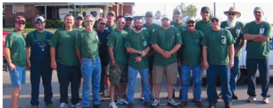
IBEW Local 558 volunteers wired four new Habitat for Humanity homes for families hard hit by tornado destruction.