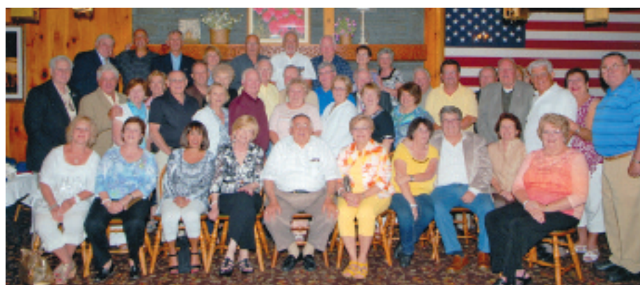
Local 3, North New Jersey Chapter, Retirees Club members at Woodloch Pines in July 2011.