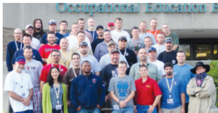
High achieving apprentices from across the U.S. shared in fellowship and sharpened their trade skills last summer at the National Training Institute in Ann Arbor, Mich.