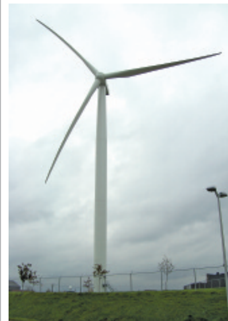
The Lincoln Electric wind turbine looms more than 40 stories in the air.