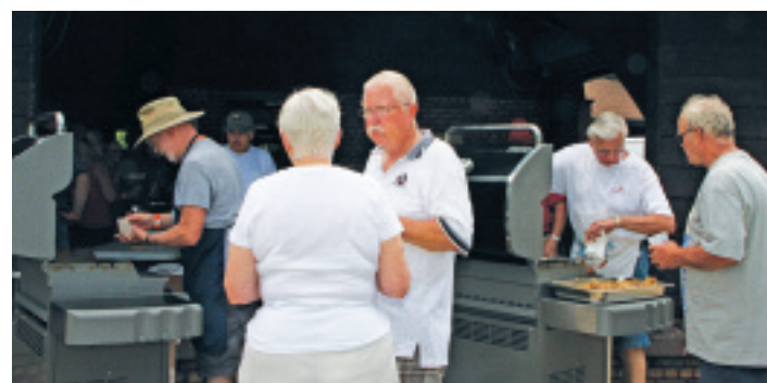
IBEW Local 110 retirees gather to cook for the annual Local 110 family picnic.

100% cotton 12oz brown duck with thermal lining & hood. Features red, white & blue embroidered IBEW initials on left chest.