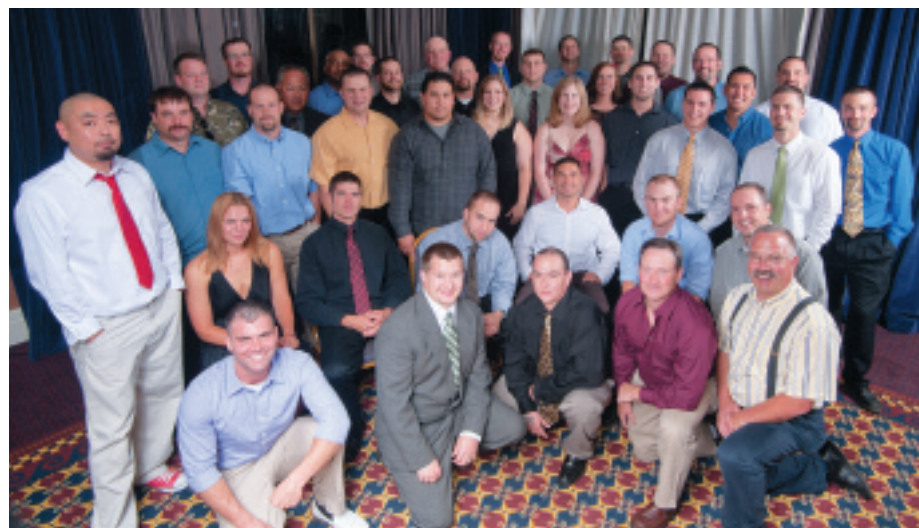
Local 76 honors class of 2011 JATC graduates.