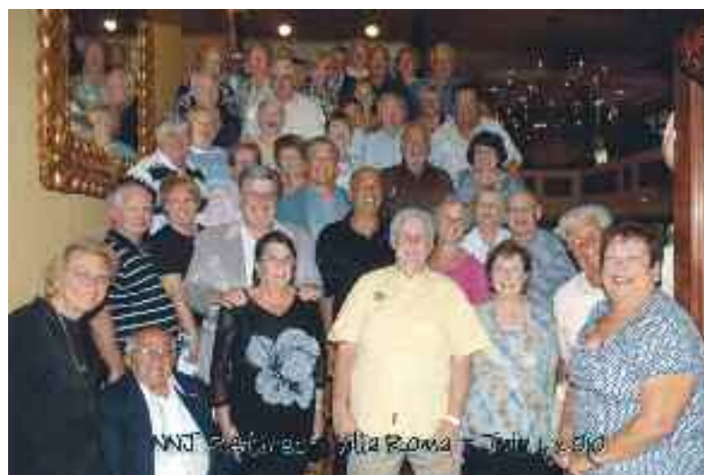
Local 3, North New Jersey Chapter, Retirees Club members enjoy five days at Villa Roma Resort.