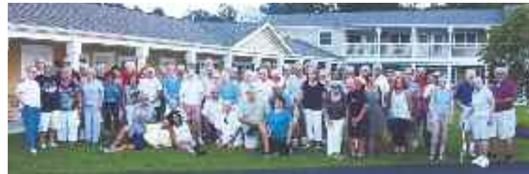
Local 3, Westchester/Putnam Chapter, Retirees Club members and spouses enjoy a "vacation" and barbecue at the Educational Center in Cutchogue, Long Island, NY.

We had our annual picnic at the Platzl Brauhaus; the weather didn't cooperate, but the event was fun. At this writing, our next get-together was set for Aug. 23, at the Educational Center, Long Island. All stay well to enjoy again.