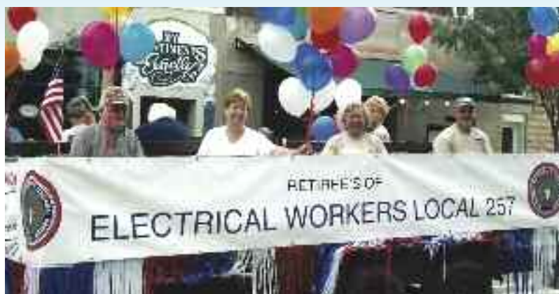
Several Local 257 retirees ride on the float in the Labor Day parade.