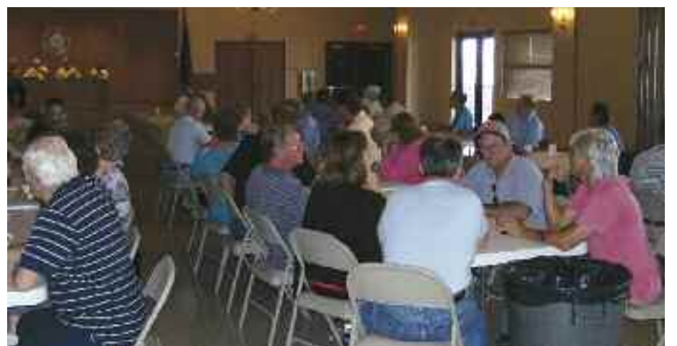
Local 130 Retirees Club members attend September meeting.

RETIREES CLUB OF L.U. 223, BROCKTON, MA—Our combined business meeting/luncheon/yard sale was held Sept. 9. The club's treasury benefitted from proceeds of the successful yard sale—and items not sold were donated to Gifts to Give, a non-