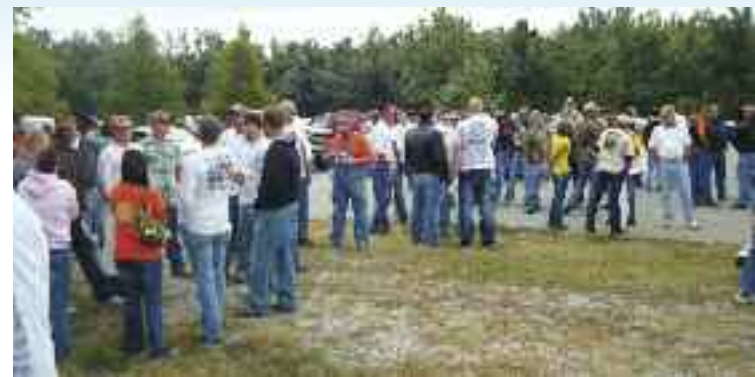
In West Frankfort, IL, approximately 500 attend the Egyptian Building & Construction Trades Council rally held Oct. 2 to protest a breach of trust by LaFarge North America.

It is vitally important that we stay politically active. If you would like the opportunity to speak with your elected public representatives, join our Committee on Political Education (COPE). We welcome members to join us at the union office on