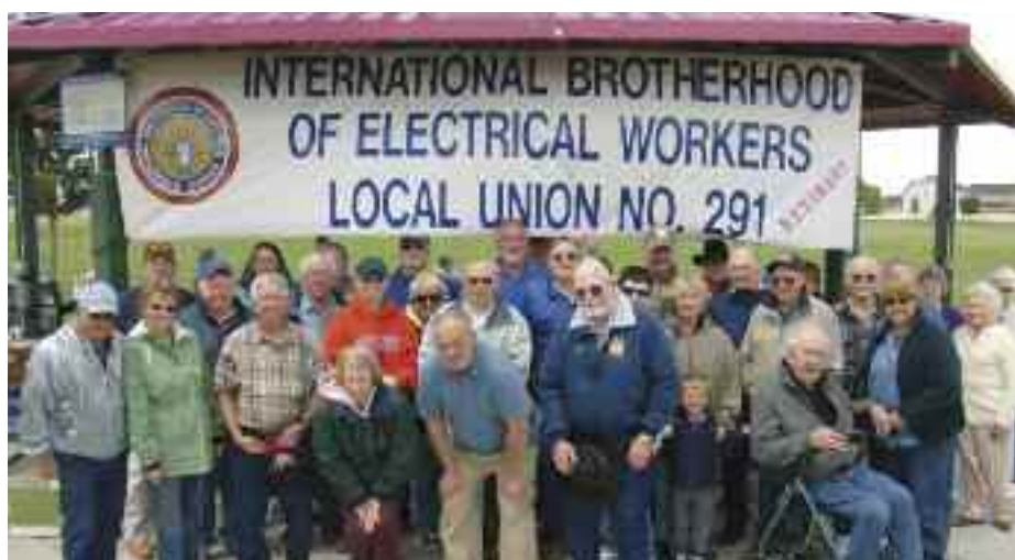
Local 291 Retirees Club members gather for a club function.