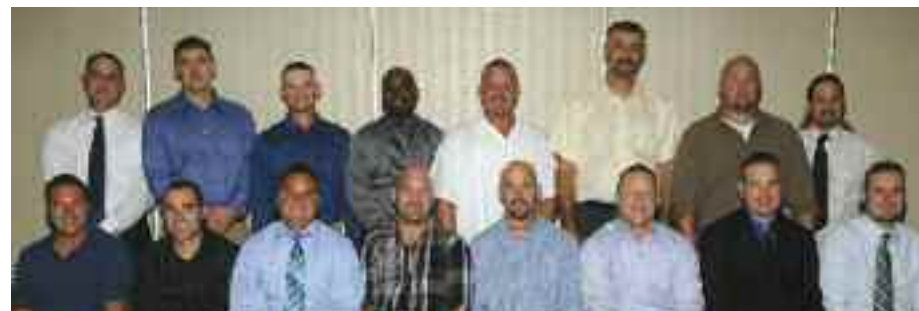
Several members of the Local 306 graduating class of 2010 gather for a photo.