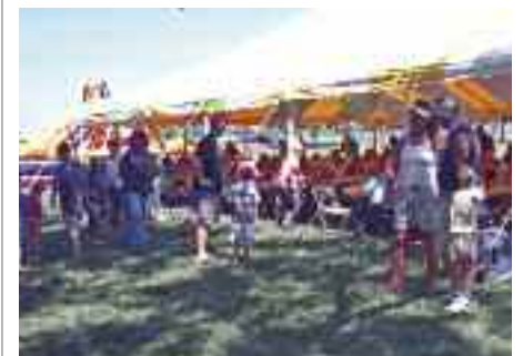
Attendees enjoy the 13th Annual IBEW Picnic for Locals 412, 1464 and 1613.

L.U. 412 (u), KANSAS CITY, MO—The 13th Annual IBEW Picnic for Locals 412, 1464 and 1613 was held Aug. 28. This event is put on solely for IBEW retirees, members and our families. It gives us a chance to relax and enjoy a day of food and fun with those we don't get the chance to see often enough. Ribs, chicken, brisket, hamburgers, hot dogs, brats, beans and a drink are provided by the Picnic Committee. There was a deejay, and events included bucket truck rides, moonwalks, face painters and games for the kids. The picnic is held on the Local 124 grounds in Kansas City, MO. Approximately 800 attended.