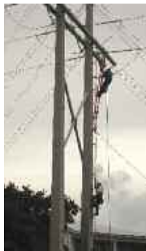
Orlando, FL, Local 222 members work under balmy skies.

L.U. 222 (o), ORLANDO, FL—As of this early fall writing, the work picture for our local had been slow for the past 16 months. Having more than 150 linemen on the books waiting for calls in Florida was a very difficult situation.