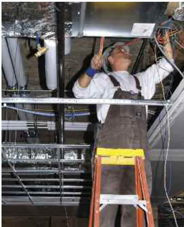
Man-hours for journeymen and apprentices have increased in Orange County, Calif., as Local 441 has effectively deployed construction electricians and construction wiremen.

Signatory CSI Electrical Contractors outbid two nonunion contractors, Berg Electric and Landmark Electric, by lowering composite labor rates through the use of new classifications, winning a 25,000-man-hour project building a biomedical lab for Dendreon. Most projects using new classifications