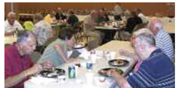
Local 134 Retirees Club members enjoy a buffet luncheon.