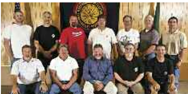
Local 76 newly elected officers gather for a photo.

The Brotherhood Committee continues its service to our area communities. We have helped with the Guadalupe House; transitional housing for homeless families; and Left Foot Organics, a vocational horticultural therapy program that works with developmentally disabled workers to provide fresh produce for area food banks. We also provided temporary power to eight nonprofit festivals and fairs. The committee thanks everyone who assisted with our fundraising