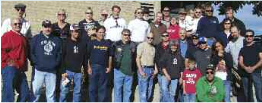
IBEW officers and members from Locals 68 and 611 attend a Get-Out-The-Vote Rally in Denver.