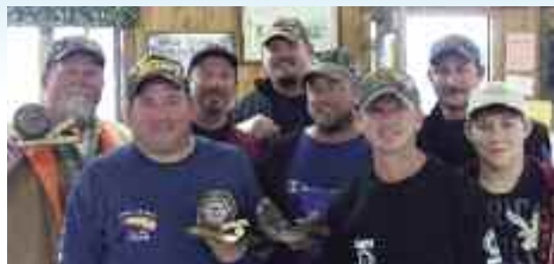
The Local 196 team of shooters and volunteers took first place in their division at the Union Sportsmen's Alliance sponsored Sporting Clay Shoot in northern Illinois.