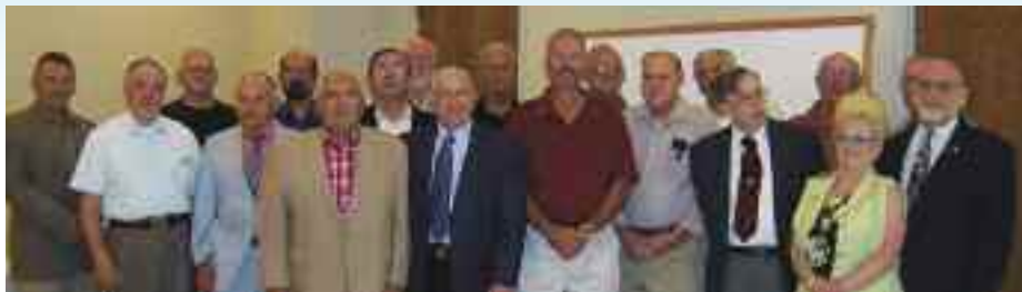
Local 26 presented service awards at the September Retired Members Club meeting.

We regularly have one or two trips to casinos in the area. Now that Maryland has legalized these establishments, perhaps we will have a shorter bus ride in 2011.