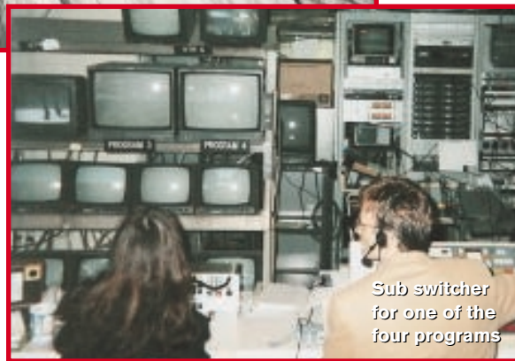
Sub switcher for one of the four programs