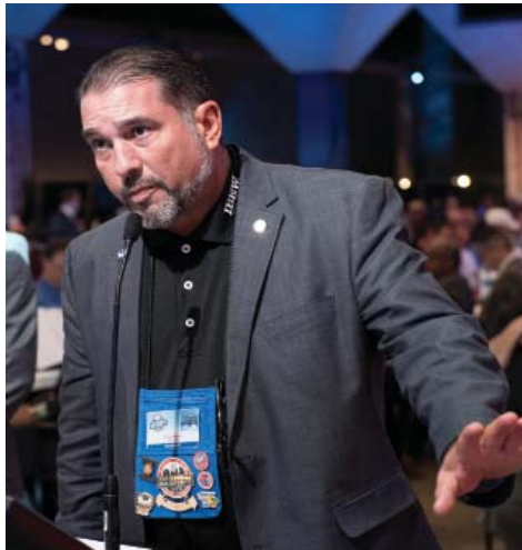
Convention delegates have their say about resolutions under consideration.

Resolution No. 7: Reaffirms the commitment to VEEP – the Veterans Electrical Entry Program, which helps veterans who have left the military gain entrance into an apprenticeship program. The resolution also calls on the IBEW to work with the National Electrical Contractors Association and the Electrical Training Alliance, the IBEW's training partner for more than 70 years, to assist locals in providing training programs for veterans.